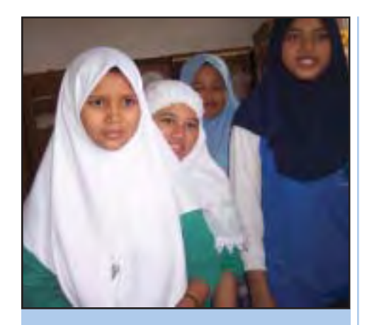
Indonesian school girls are taught how to steer clear of trafficking.

USAID is at the forefront of agencies around the world in its ability to respond to natural and manmade disasters.