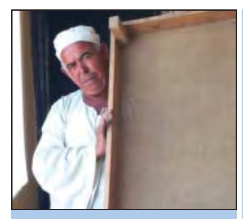
An Egyptian farmer uses a new technique for air drying aromatic and medical plants that increases production, quality and income.

Direct-hire and contract employees based in the United States and at field missions overseas make up USAID's workfirce.