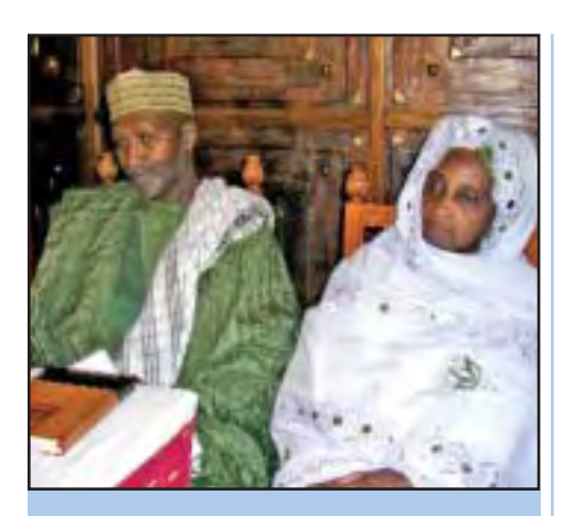
Religious leaders from West and East Africa discuss family planning and reproductive health issues at a USAID-sponsored workshop in Bamako, Mali.