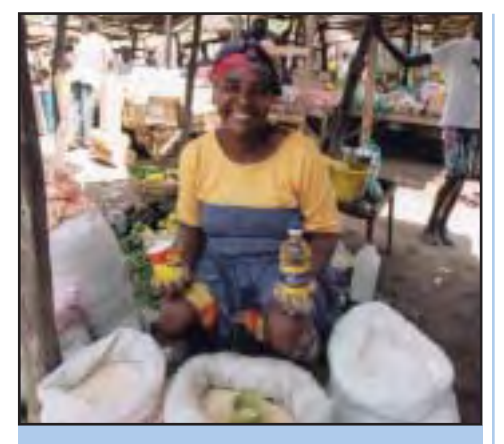
A Haitian woman has progressed from selling rice by the roadside to running her own restaurant.

USAID has formulated 39 standardized program components to link impacts to the strategic and performance goals of the joint U.S. Department of State and USAID Strategic Plan.