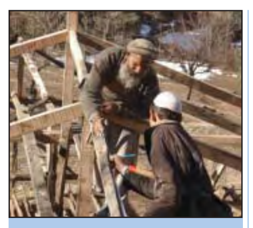
Master builders in the Chatterplain region of Mansera District in Pakistan train local villagers how to construct earthquake resistant transition shelters.

USAID implements, in whole or in part, 20 presidential international development initiatives.