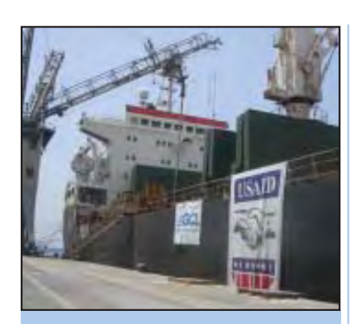
The USAID Commodities Program allows for the purchase of U.S. goods and export to people in need.