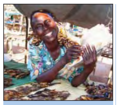
A woman sells fish at her stand in the local market in Sudan.

A small business is an entity that is independently owned and operated, not dominant in the field of operation in which it is bidding on government contracts, organized for profit and qualified under specific criteria and size standards.