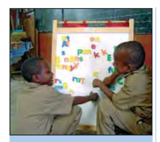
Students form words out of block letters in Montego Bay, Jamaica.