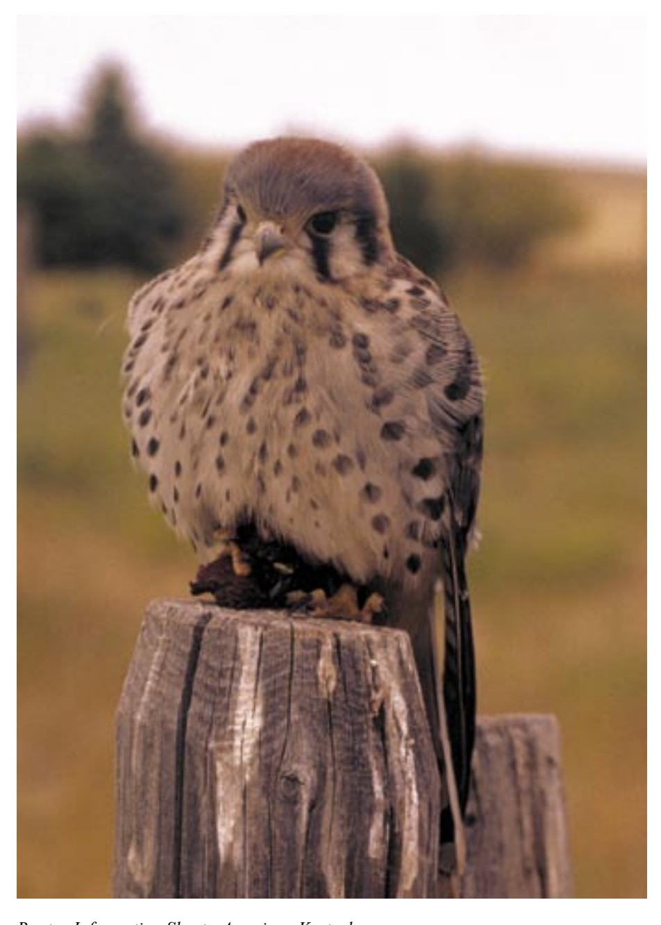
Raptor Information Sheet - American Kestral

American kestrels form strong pair bonds and some pairs remain together across years. Requires a cavity, natural or manmade, for nesting, and will nest in bird boxes, holes in trees (made by other birds or natural), cliffs and the crevices of buildings. Generally requires a few prominent elevated perches for hunting nearby. Will vigorously defend its nest against other cavity nesters. Will lay a replacement clutch if first clutch is lost early in the breeding season. Can lay two broods in one season if first clutch is early.