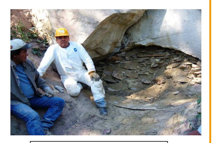
Corral Creek Mine construction of native rock wall