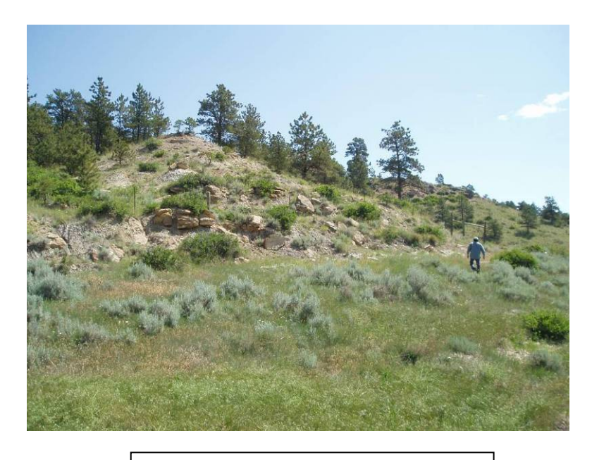
Luther #3 Mine excellent revegetation of backfilled highwall