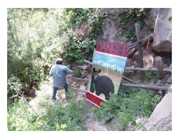
Corral Creek Mine barricade and sign