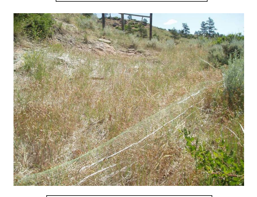
Luther #3 Mine excellent utilization of erosion control blanket woven with straw