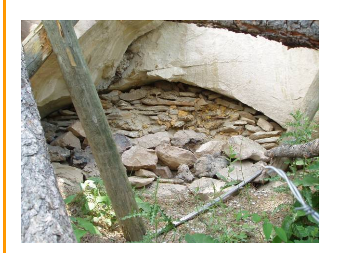
Corral Creek Mine completed native rock wall