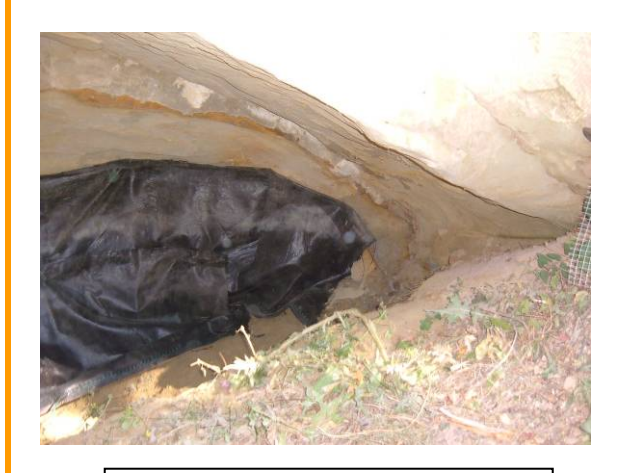
Corral Creek Mine PUF plug in portal