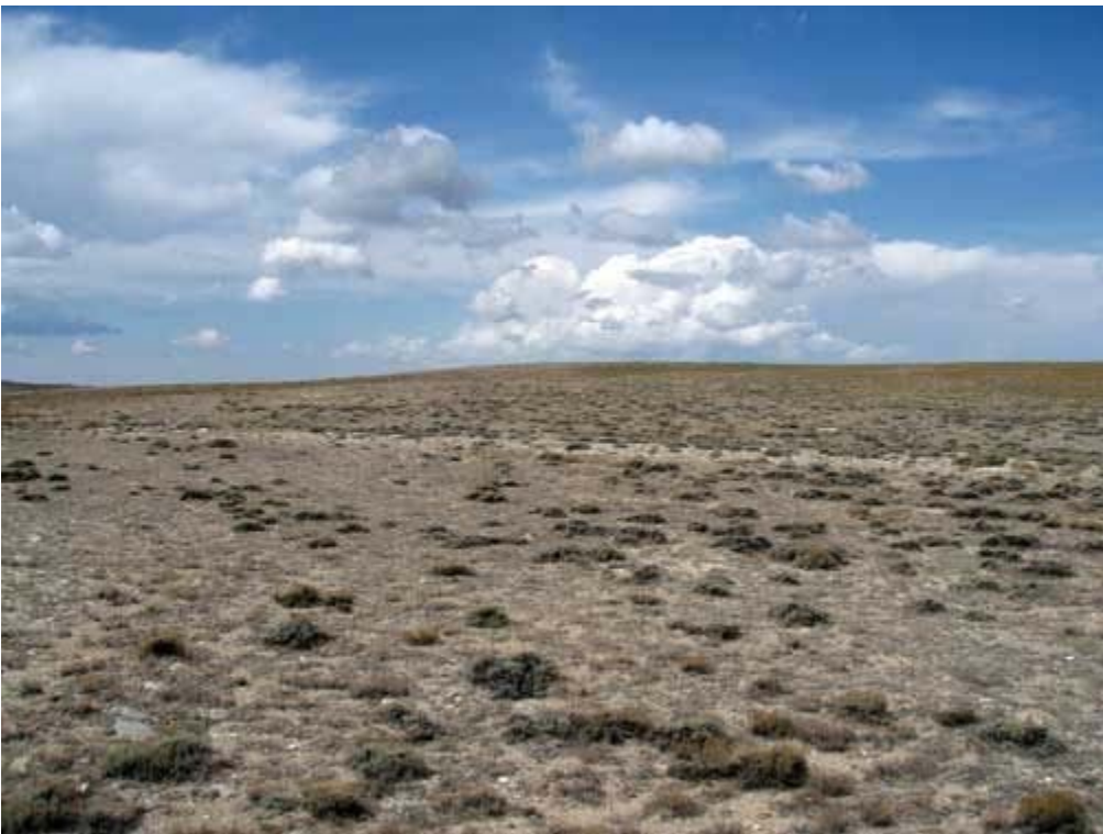
Photo 10: From Segment "D" of the Seminoe Cutoff, looking northwest at the AT&T telephone line (abandoned).