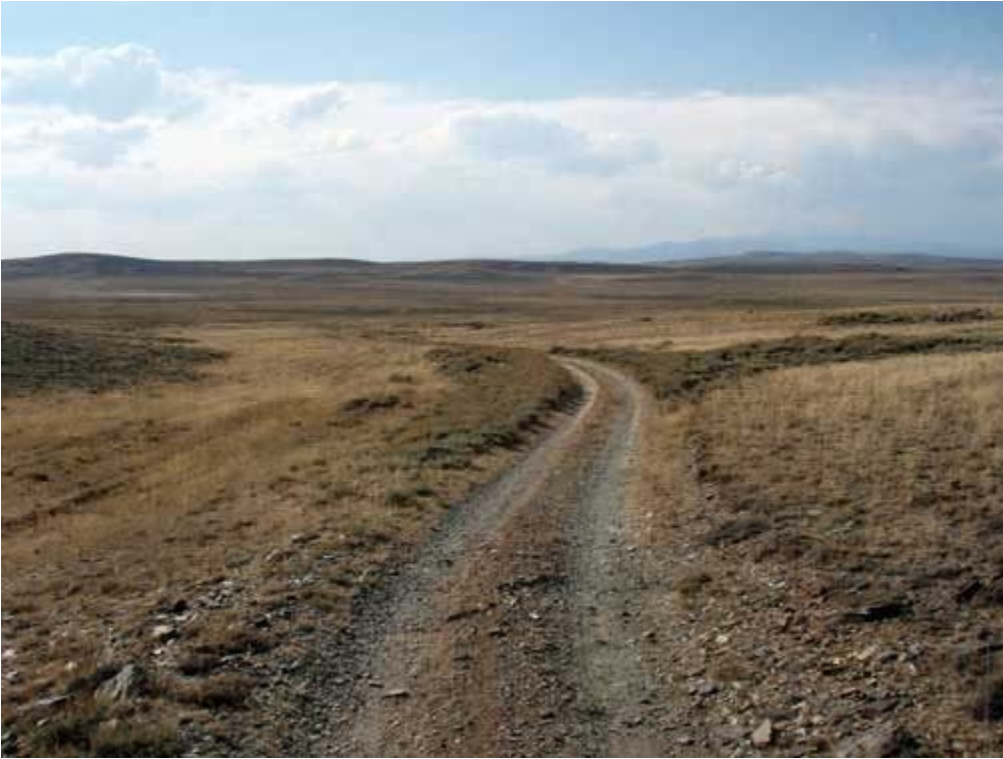
Photo 14: Segment "D" of the Seminoe Cutoff, looking west. Segment D begins slightly northeast of North Bear Mountain and ends at the 3 Forks-Atlantic City Road. This 11-mile long segment's condition is considered 'excellent': this segment possesses excellent integrity of ruts, and mostly excellent integrity of the historical setting around the trail. The historical and scenic settings along this segment are very good, and very few modern intrusions are present. The AT&T telephone cable scar is nearly healed and is often difficult to see, and other than one regular fence (on state land) and one buck and pole fence, the segment is untouched by modern intrusions until it reaches the 3 Forks-Atlantic City Road.