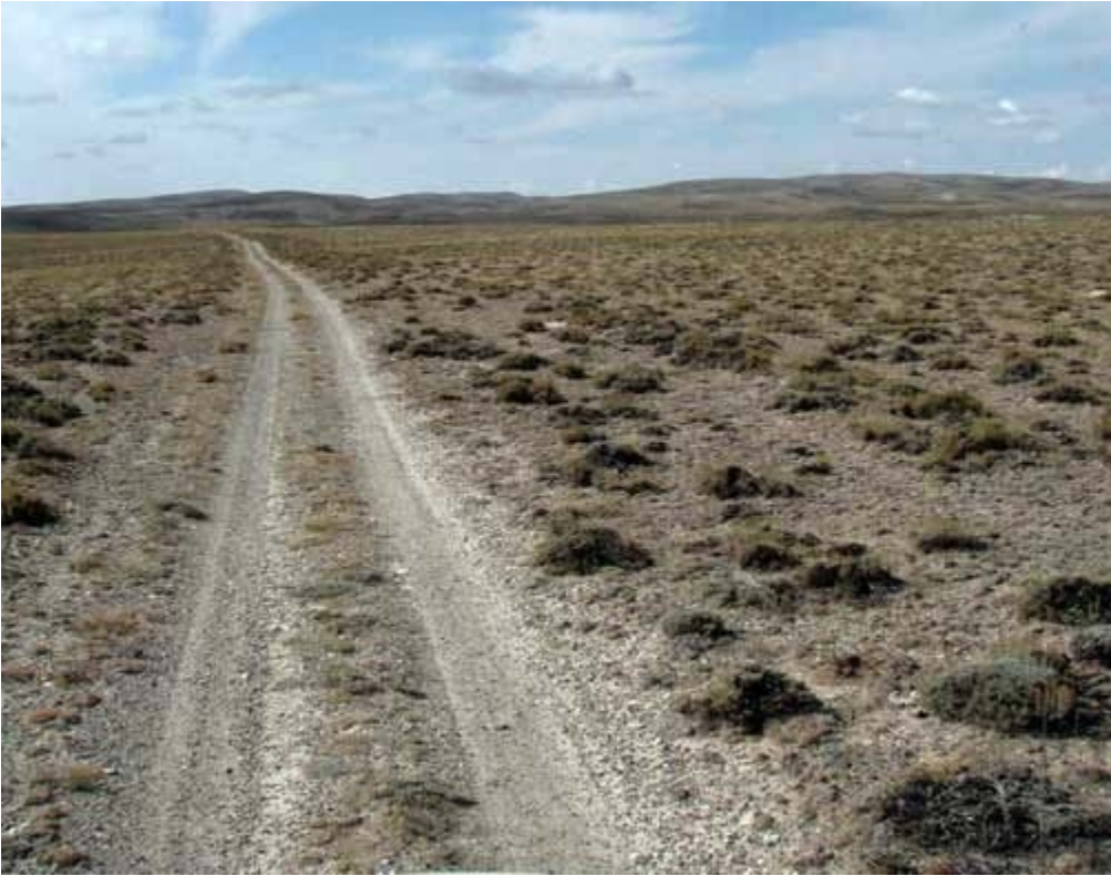
Photo 7: Segment "C" of the Seminoe Cutoff, looking west. Segment C starts just east of the Alkali Creek valley and ends a little northeast of North Bear Mountain. This six-mile long segment's condition is considered 'good-excellent'. One unreclaimed well pad, the AT&T telephone cable, a windmill, and a trough are the modern impacts visible along this segment, but they are minor enough that they do not affect the overall 'good-excellent' condition of the segment and its settings.