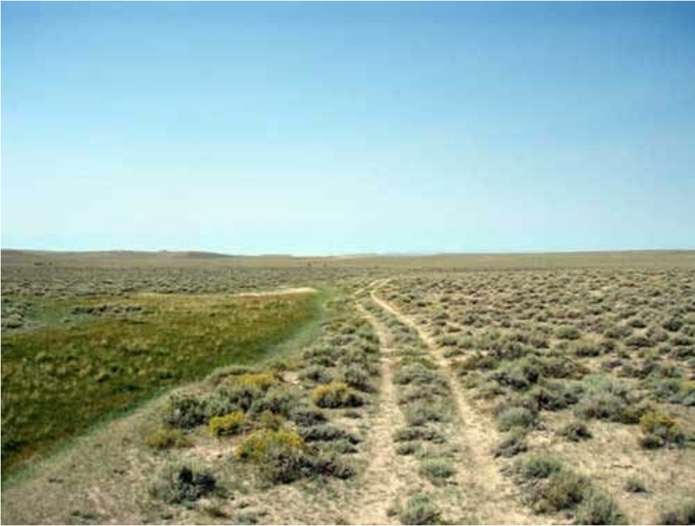
Photo 1: Segment "A" of the Seminoe Cutoff, looking west along Warm Springs Creek. Segment A starts at the beginning of the Seminoe Cutoff and ends at the Bison Basin Road. This 1½-mile long segment condition is considered 'good'. Fences and an upgraded road are modern intrusions along this segment, but they are minor enough that they do not affect the overall 'good' condition of the segment and its settings.