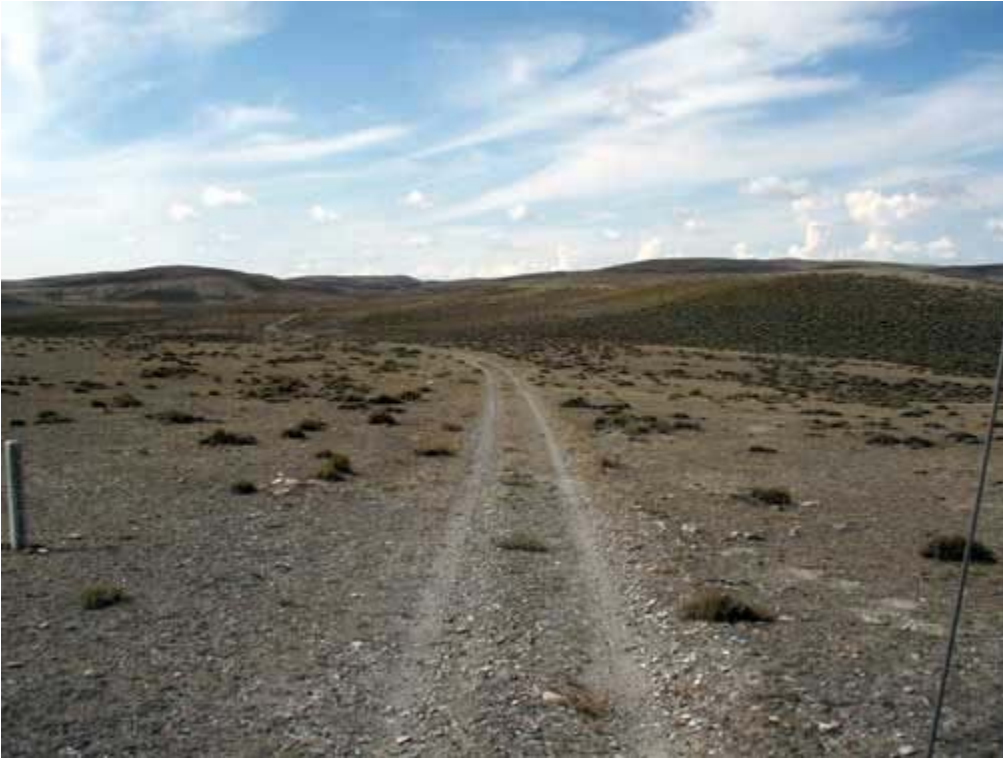
Photo 8: Segment "C" of the Seminoe Cutoff, looking west. Segment C starts just east of the Alkali Creek valley and ends a little northeast of North Bear Mountain. This six-mile long segment's condition is considered 'good-excellent'. One unreclaimed well pad, the AT&T telephone cable, a windmill, and a trough are the modern impacts visible along this segment, but they are minor enough that they do not affect the overall 'good-excellent' condition of the segment and its settings.