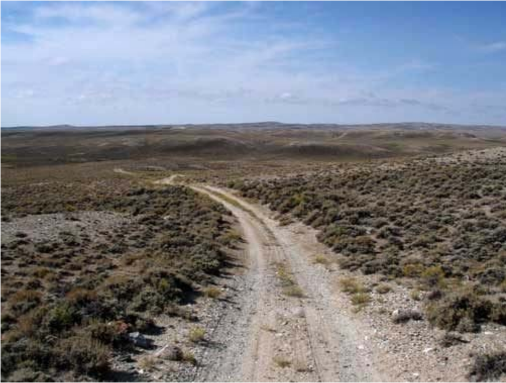
Photo 6: Segment "C" of the Seminoe Cutoff, looking west into the Alkali Creek valley. Segment C starts just east of the Alkali Creek valley and ends a little northeast of North Bear Mountain. This six-mile long segment's condition is considered 'good-excellent'. One unreclaimed well pad, the AT&T telephone cable, a windmill, and a trough are the modern impacts visible along this segment, but they are minor enough that they do not affect the overall 'good-excellent' condition of the segment and its settings.