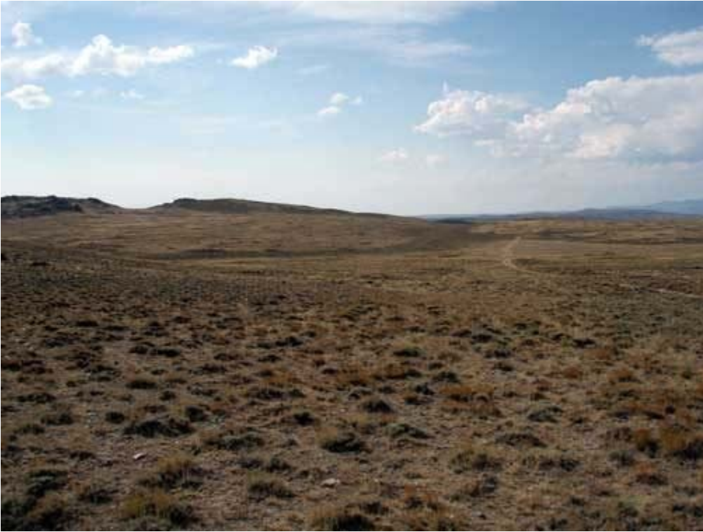
Photo 12: Segment "D" of the Seminoe Cutoff, looking west. Segment D begins slightly northeast of North Bear Mountain and ends at the 3 Forks-Atlantic City Road. This 11-mile long segment's condition is considered 'excellent': this segment possesses excellent integrity of ruts, and mostly excellent integrity of the historical setting around the trail. The historical and scenic settings along this segment are very good, and very few modern intrusions are present. The AT&T telephone cable scar is nearly healed and is often difficult to see, and other than one regular fence (on state land) and one buck and pole fence, the segment is untouched by modern intrusions until it reaches the 3 Forks-Atlantic City Road.