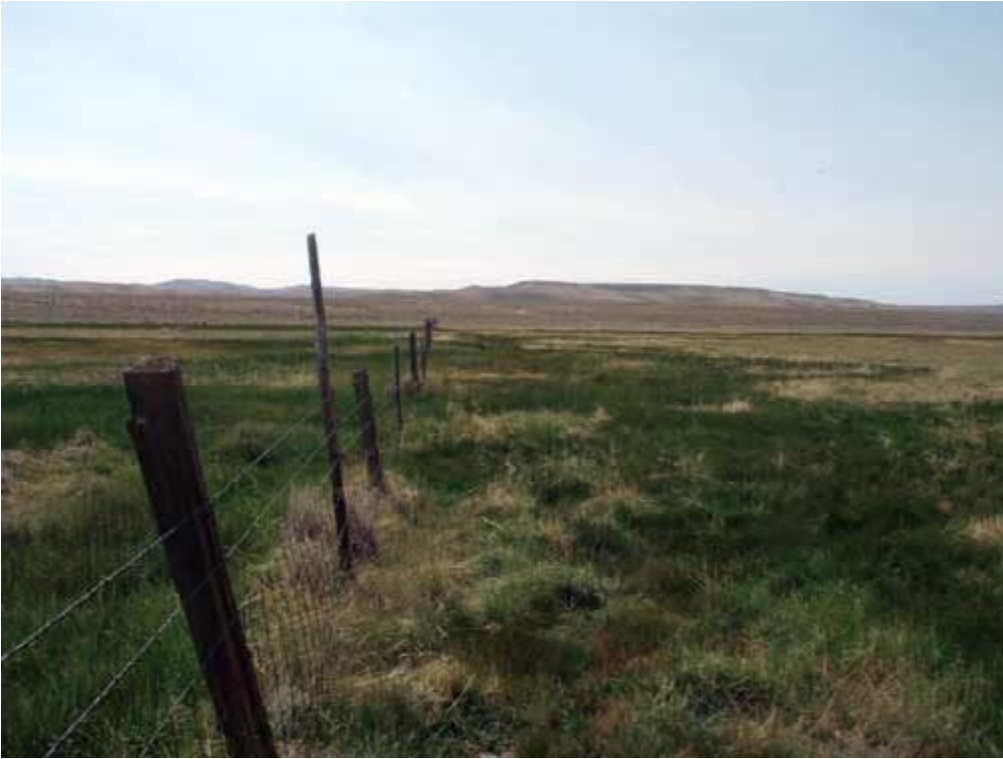
Photo 2: From Segment "A" of the Seminoe Cutoff, looking south along private land fence on Warm Springs Creek. Segment A starts at the beginning of the Seminoe Cutoff and ends at the Bison Basin Road. This 1½-mile long segment condition is considered 'good'. Fences and an upgraded road are modern intrusions along this segment, but they are minor enough that they do not affect the overall 'good' condition of the segment and its settings.