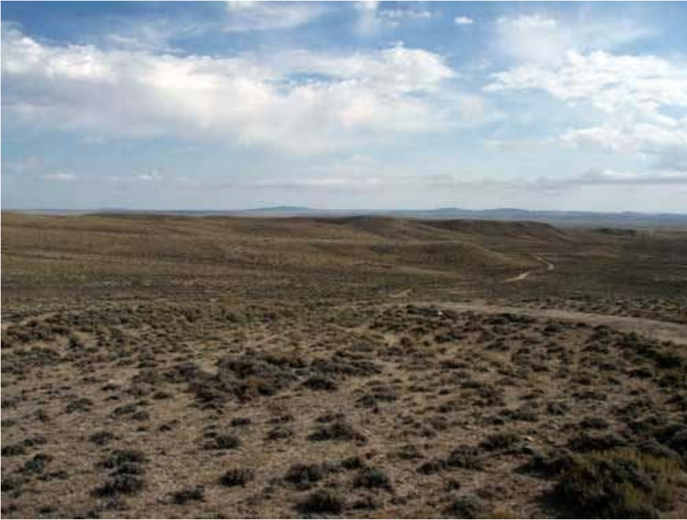
Photo 5: Segment "B" of the Seminoe Cutoff, looking west. Segment B starts at the Bison Basin Road and ends just before the trail descends into the Alkali Creek valley. This 4½-mile long segment's condition is considered 'fair-good': the integrity of its ruts and swales is fair, and the integrity of its historical setting ranges from good to fair. Several old, unreclaimed well pads, the AT&T telephone cable, a fence, evidence of blading along the trail, and a few bladed roads are some of the modern impacts to this segment. Although the segment is still considered significant, the impacts along it have resulted in a 'fair-good' rating.