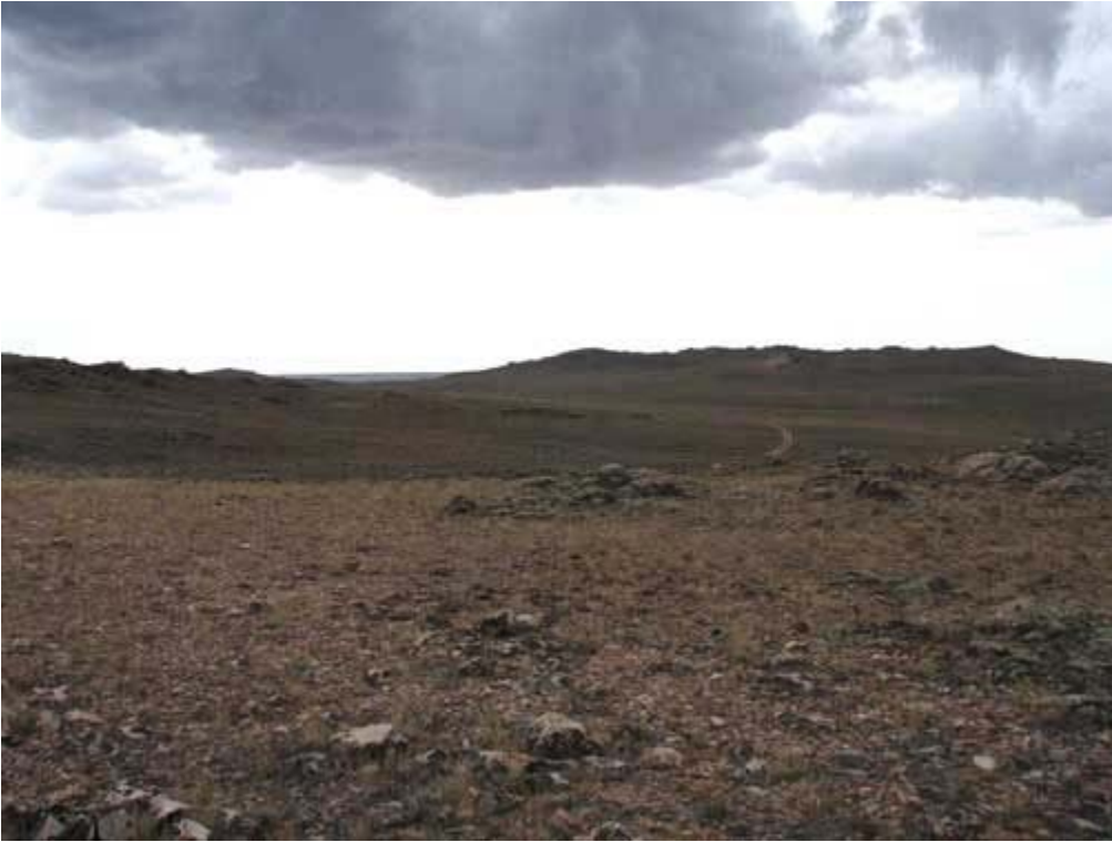
Photo 11: Segment “D” of the Seminoe Cutoff, looking west. Segment D begins slightly northeast of North Bear Mountain and ends at the 3 Forks-Atlantic City Road. This 11-mile long segment’s condition is considered ‘excellent’: this segment possesses excellent integrity of ruts, and mostly excellent integrity of the historical setting around the trail. The historical and scenic settings along this segment are very good, and very few modern intrusions are present. The AT&T telephone cable scar is nearly healed and is often difficult to see, and other than one regular fence (on state land) and one buck and pole fence, the segment is untouched by modern intrusions until it reaches the 3 Forks-Atlantic City Road.