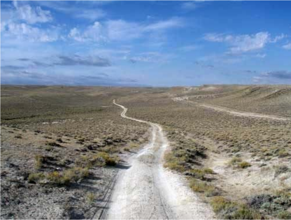
Photo 4: Segment "B" of the Seminoe Cutoff, looking west. Segment B starts at the Bison Basin Road and ends just before the trail descends into the Alkali Creek valley. This 4½-mile long segment's condition is considered 'fair-good': the integrity of its ruts and swales is fair, and the integrity of its historical setting ranges from good to fair. Several old, unreclaimed well pads, the AT&T telephone cable, a fence, evidence of blading along the trail, and a few bladed roads are some of the modern impacts to this segment. Although the segment is still considered significant, the impacts along it have resulted in a 'fair-good' rating.