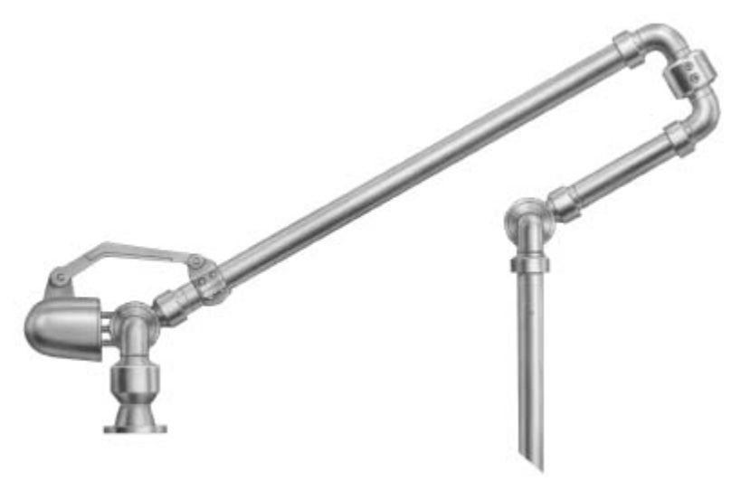
truck or rail car unloading arm

Failure scenarios that might be associated with receiving argon include adding contaminated liquid to the detector tank or spilling argon during the connection. The liquid will be repeatedly analyzed before it enters the detector tank. If the electron lifetime meters indicate a problem, a chromatograph or spectrometer might be used to determine the type of contaminant. At very low concentrations it may not be possible to determine an unknown contaminant. A spill during connection could cause personnel injury from frostbite or asphyxiation. The risk will be reduced by having good equipment on hand, having written procedures for normal and abnormal situations, training operators etc.