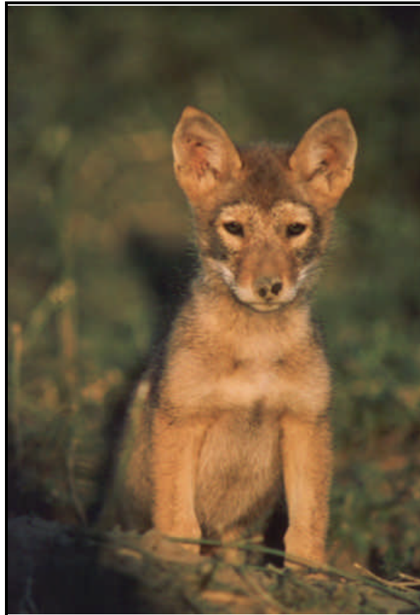
Coyote pup

+ one or more specimens actually observed * possible occurrence (within range)