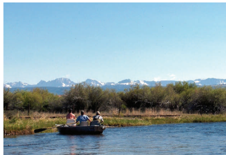
The Green River's original name was "Seedska-dee Agie", which comes from the Shoshone Indian word "Sisk-a-dee-agie", meaning "river of the prairie hen."

PLEASE SELECT THE APPROPRIATE SIZE CAMPSITE FOR ACTIVITY AND VEHICLE