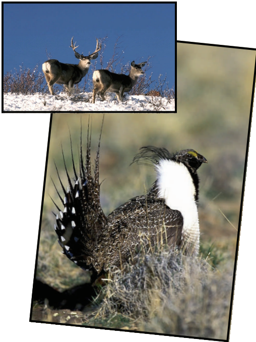
The Upper Green River Valley is prime habitat for Sage Grouse.

This region also contains one of the longest big-game migration routes in North America. Each year thousands of pronghorn antelope use this 6,000-year-old route as they travel from summer ground in the Greater Yellowstone region to winter ranges in the Upper Green River Valley and Rock Springs area. In total, nearly 100,000 pronghorn, deer, moose, and elk spend the winter here.