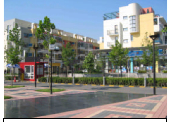
A typical suburban development by Vanke, this project includes homes, stores and schools.

does not appear to have been extended to individual mortgage loans for home buyers, however). The long-term impact of these policies is unclear. Real-estate industry sources do not believe that they will reduce developers' willingness to invest in the area, since the government has already made long-term commitments to infrastructure development in support of the 2010 World Expo. However, postponing further development of the subway and other internal transportation infrastructure ensures that Shanghai's already miserable traffic situation will get worse. This may encourage more businesses to relocate to the suburbs, or to other major urban centers nearby.