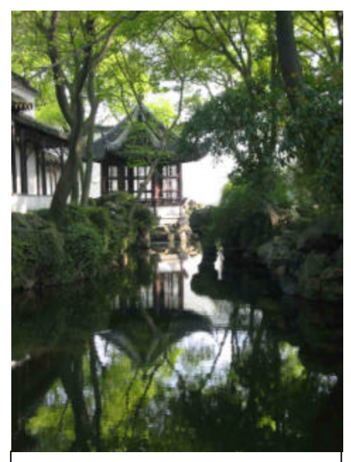
Famous for its gardens, Suzhou has also become an important alternative location for businesses fleeing high costs in Shanghai

Suburbanization is actually just the tip of the iceberg. Although cheaper than downtown, even the suburban districts of Shanghai are expensive by Chinese standards, and there are limits to how much additional population they can absorb. Many businesses are now opting