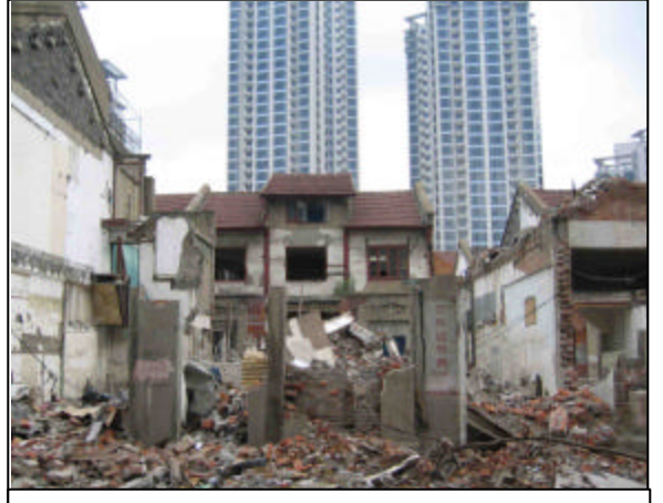
Old buildings come down as new ones go up to make space for Shanghai's 20 million residents.

Some of the most effective reforms are being pursued by the Shanghai municipal government in an effort to clean up the notoriously opaque real estate market. For land sales, the first step in the reform effort was the move to open bidding. This was done to address abuses wherein developers offered favors to local officials in exchange for sweetheart deals. Since most deals were concluded off the books. no effective market for land existed. Following a series of controversies, Shanghai switched to open bidding in July 2001, well ahead of the rest of the country. Putting developers into direct competition, often for the first time, open bidding led to an immediate rise of as much as 30% in land prices in some districts.