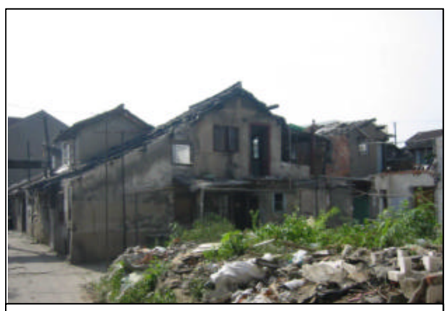
As older homes are demolished, the need for affordable housing is growing.

are completed, as compared to 66% for normal housing (for villas, sales technically cannot start until all public facilities are completed). This is being accompanied, however, by restrictions on the re-sale of unfinished apartments, in order to avoid speculation. The standard is not complete. as the city government has yet to decide exactly what will qualify as 'low-cost.' Officials have been quoted as saying that the standard will probably be in the range of RMB 6,000 – 7,000 per square meter and lower. By way of comparison, the average cost of housing in Shanghai at the end of 2003 was RMB 5,118/square meter, while the national average for urban areas is RMB 2,212/square meter.