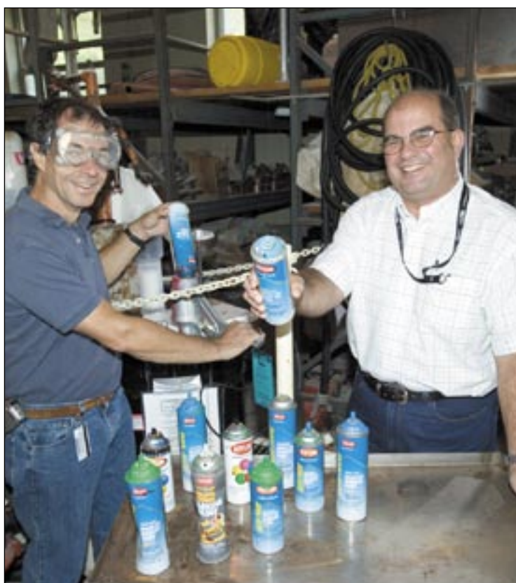
10/23/05