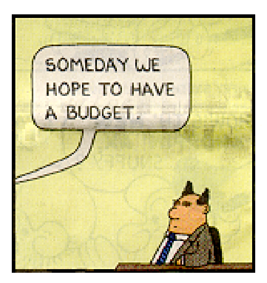
Dilbert by Scott Adams