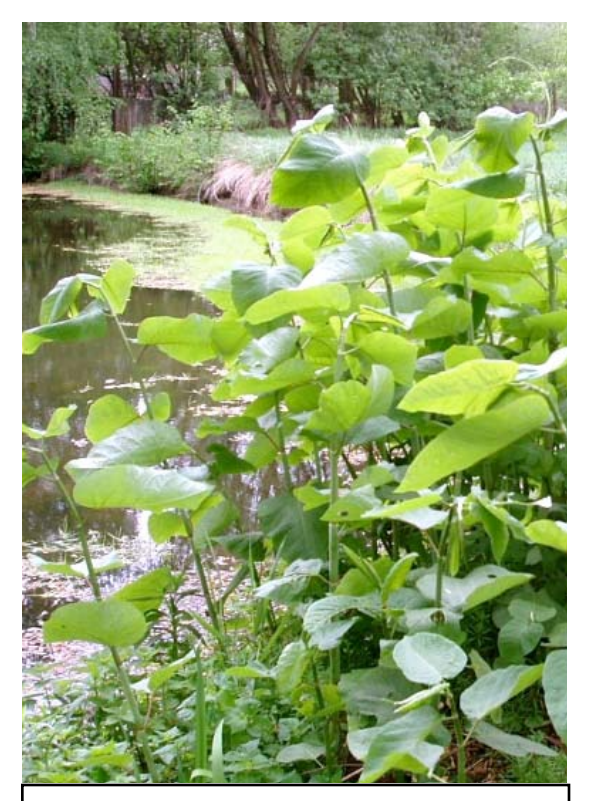
Giant knotweed was one of the primary species of concern we looked for during our aquatic invasive species surveys.

implementing a yearly rigorous survey protocol requires resources for training, surveys, and data entry. Without adequate funding (about $7000 to sample 150 sites each year) aquatic invasive species surveys may not be done.