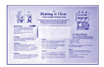
Making It Clear: A Clear Language and Design Screen comes laminated and is approximately the size of a placemat (17" x 11").

A companion to the handbook, Making It Clear: A Clear Language and Design Screen assists in the creation of a readable and attractive report, letter, manual, or other document. Side 1 provides pointers on appearance, such as line length, justification, type style and size, white space, and illustrations, as well as a 6 x 2-inch clear screen to view sample sections of the document. Side 2 provides questions to consider about audience, content, organizing material, word choice, sentence length, and so forth.