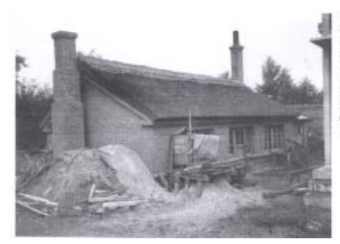
Farm house with attached saw mill, Heilongjiang, 1988.

Bicycles Small buses Poor roads Small stores Few AC in houses Poor schools Few restaurants 2 star hotels Gov't guest houses Limited internet Access.