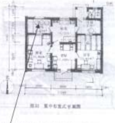
Placement of grain bins in farm house.