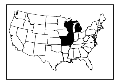
States in which the Hine's emerald dragonfly is found. The Hine's emerald dragonfly is also known as the Ohio emerald dragonfly or Hine's bog skimmer.