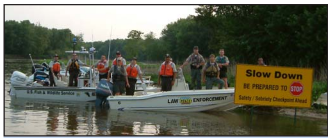
- USFWS Photo Service and Iowa DNR law enforcement officers at a sobriety safety check point in the Upper Mississippi River Refuge.

the main channel where the vast majority of boaters operate," he said. "Second, the check point area was purposely well marked." Word of the operation quickly spread and the boating public avoided the area. Clyde Male, Upper Miss. NWFR