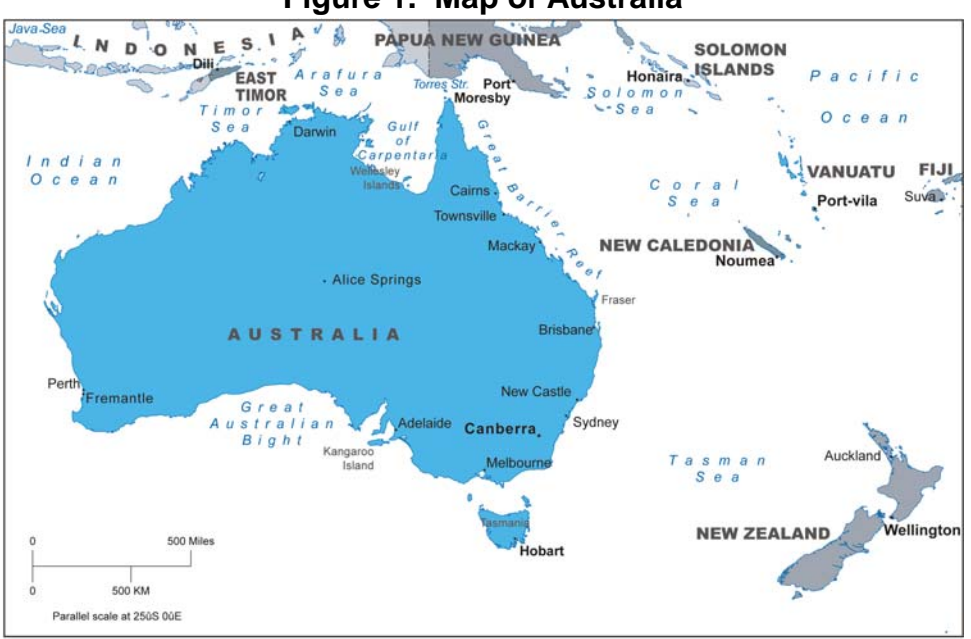
Figure 1. Map of Australia

Asia or whether it will seek to use East Asian regionalism to exclude the United States, which neither Australia nor Japan would wish to see.<sup>110</sup>