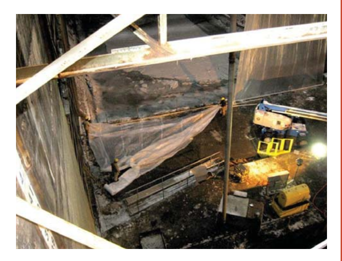
Crews hang plastic curtains to isolate the work area.

Maintenance crews have already dewatered, inspected and made repairs to lock structures and machinery at Eisenhower Lock which are inaccessible during the navigation season. Repairs were made to cracks in the downstream miter gate, and shims were installed on the upstream miter gate to compensate for wear on the miter contact blocks. Snell Lock has been covered and dewatered and heaters have been installed and the work areas set up. In the first photo, you can see crews hanging plastic curtains to isolate a work area to conserve