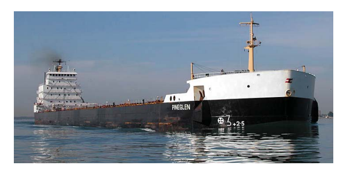
The Canadian M/V PINEGLEN, closed the St. Lawrence Seaway 2007 Navigation Season.

The Canadian M/V PINEGLEN loaded with 15,692.5 tons of pig iron (refined ore) bound for Marinette, Wisconsin, cleared the U.S. Seaway locks on December 28. This ship officially closed the Montreal-Lake Ontario section of the St. Lawrence Seaway ending the binational waterway's 48th navigation season at 283 days.