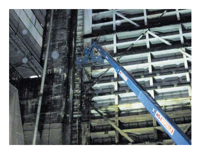
Crews being lifted to replace damaged rubber fenders on the downstream miter gate.

heat and energy. Work has commenced for replacing damaged rubber fenders on the downstream miter gate at Snell Lock. This work is being done from a personnel lift as can be seen in the second photo. Crews have begun removing a filling valve at Snell Lock for reinforcing and painting and inspections of the culvert valve operating machinery open gearing at both locks are almost complete. All projects are on schedule for completion in early to mid-March.