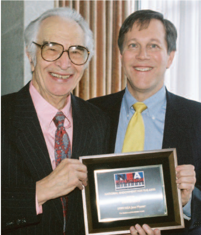
NEA Chairman Dana Gioia (right) presents Dave Brubeck with a plaque celebrating his induction as an NEA Jazz Master.

Dana Gioia Interviews Dave Brubeck on Cultural Diplomacy