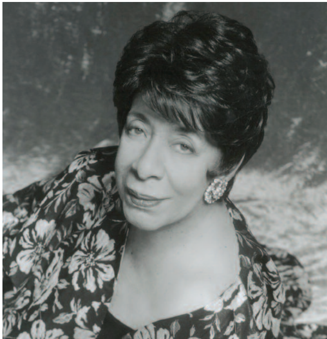
2005 NEA Jazz Master Shirley Horn.

On February 15, 2006 , a Congressional resolution introduced by District of Columbia Delegate Eleanor Holmes Norton and Michigan Representative John Conyers Jr. was passed by unanimous consent in the U.S. House of Representatives, recognizing 2005 NEA Jazz Master Shirley Horn, who passed away on October 20, 2005, for her contributions to American culture. Rep. Conyers, Nevada Representative Jon Porter, and Illinois Representative Danny Davis spoke in support of the resolution. An excerpt from the resolution follows: