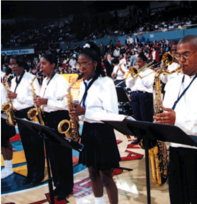
Youth perform live at basketball games as part of the NEA-supported Jazz Sports program.