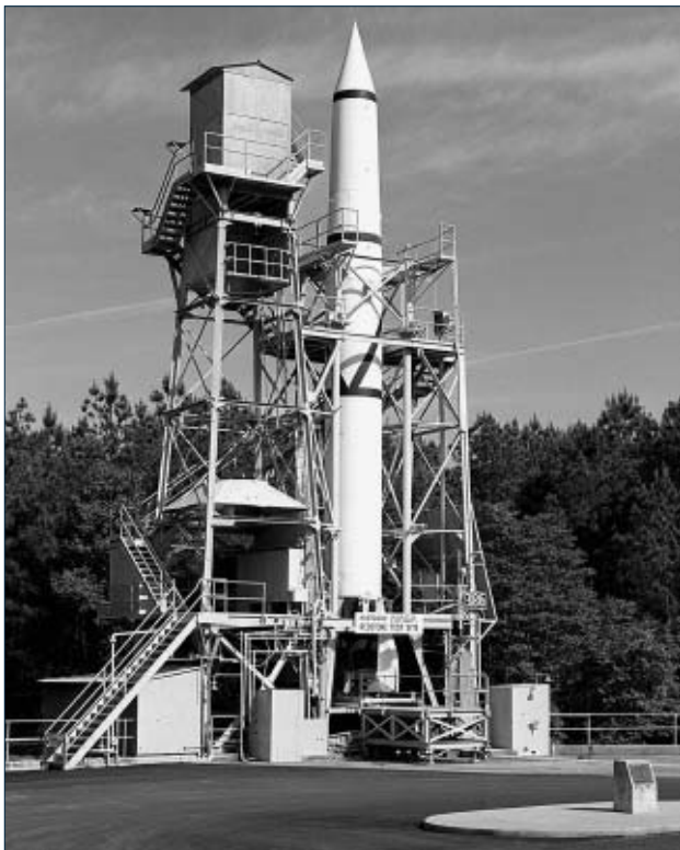
The Redstone Test Stand, used in the 1950s in the early development of the Redstone missile propulsion system, static tested the Redstone missile that launched Alan Shepard into space.

The Department of the Interior's National Park Service (NPS) manages the National Register and NHL programs. The NPS nominates NHLs, with the determination often being made through theme studies. In 1984, Dr. Harry Butowsky of the NPS led a Man-In-Space theme study, which found that 24 facilities or complexes related to manned space exploration merited NHL status. NASA owned or operated 20 of these facilities, including the Redstone Test Stand, which was already on the National Register . In addition, the NPS nominated NASA's Mission Control Center located at Cape Canaveral Air Force Station as an NHL. It was officially designated as a National Historic Landmark on 3 October 1985. The NHL designation for the Rocket Engine Test Facility at Glenn Research Center in Cleveland, Ohio, was withdrawn on 4 April 2005, when an airport expansion forced the facility to be demolished.