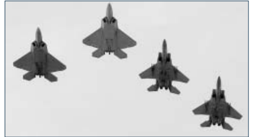
Two Air Force F-22A Raptors and two F-15s performed a flyover at the unveiling ceremony.

“Over there!” someone yelled as all eyes excitedly turned toward the two F-22A Raptors and two F-15s flying overhead in commemoration of Langley Field in Hampton, Virginia.