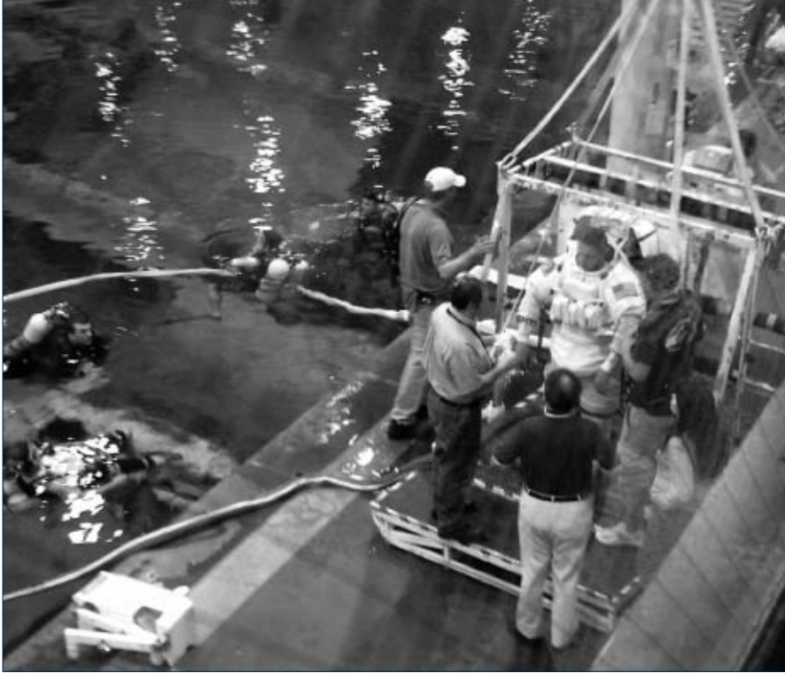
Astronauts and support specialists ending a training session at the Neutral Buoyancy Laboratory.