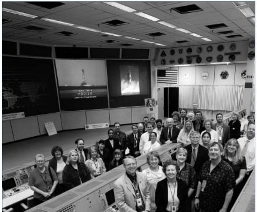
Participants of the Annual Joint History and Records Management Meeting at the Old Mission Control Center.