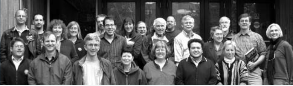
Participants of the NASA History Division and Dibner Institute seminar entitled “Cosmic Evolution and Astrobiology” gathered outside the Marine Biological Laboratory.

always-controversial question, “What is life?” All the while, the students kept the proceedings lively with a constant barrage of questions.