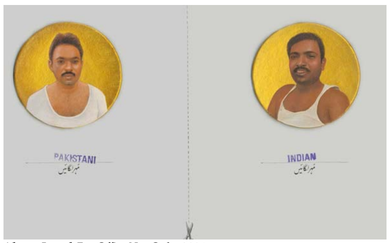
Ahsan Jamal For Office Use Only, 2004 Mixed media on wasli and board