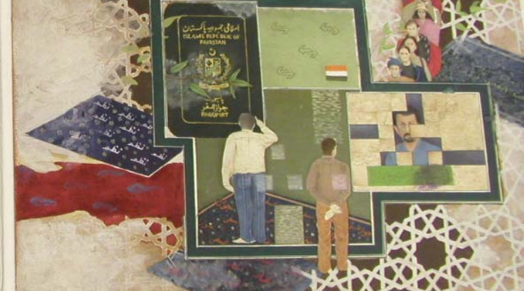
Hasnat Mehmood Untitled, 2006, gouache and paper collage on wasli

"to explore divisions at a deeper level." The Partition of India and Pakistan at their independence from Britain in 1947 precipitated violence in which hundreds of thousands of people died, as Hindus and Sikhs fled to India, Muslims to Pakistan, and many others were caught up in a chaotic transition. Families were torn apart in a population exchange that uprooted more than 14 million people during the months after independence. Scars of the Partition remain in the psyche of South Asians, evident in the many attempts in literature and the arts to analyze its impact on both sides of the border.