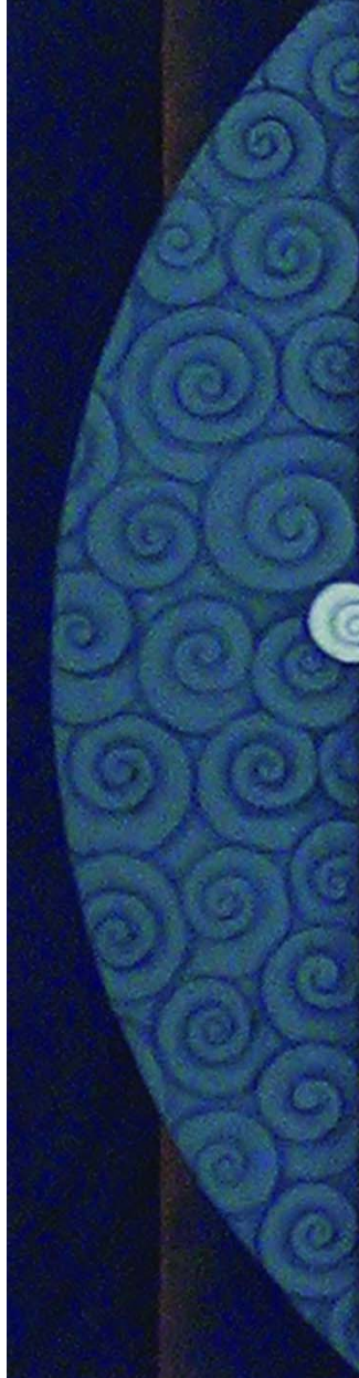
Chhotu Lal Power of the Soul, 2006, gouache on handmade paper