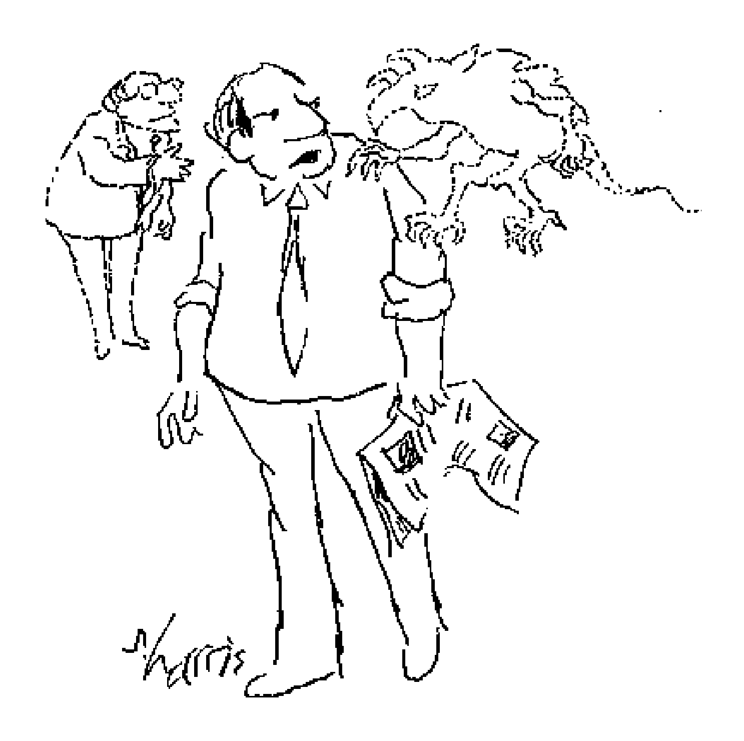
"Very well, I'll introduce you. Ego, meet Id. Now get back to work."