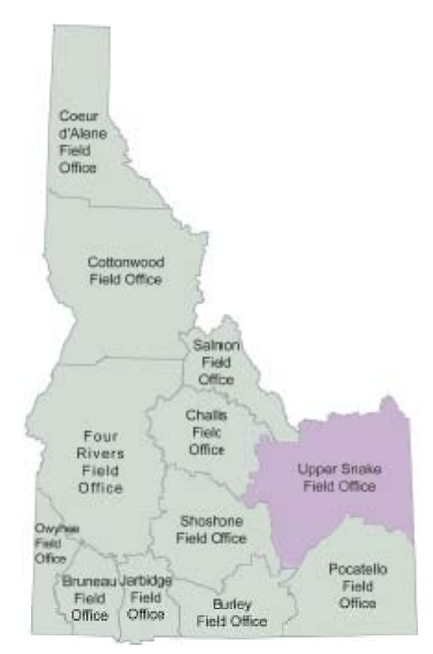
Idaho BLM is divided into four different districts. Each district is divided into field offices, as shown above. The Salmon, Challis, Upper Snake and Pocatello Field Offices comprise Idaho Falls District.