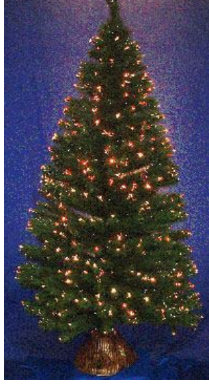
Fiber Optic Tree

Fiber optic lights are cool to the touch, as only light is transmitted from the fiber and not heat. The incandescent light source is located in the base of the tree with ventilating holes that must not be covered. The cost for such trees ranges from $20 for a 2-3-foot tree to over $400 for large trees. Fiber optics is also now used in decorations such as Santa or angel figurines, stars, topiaries, and poinsettias.