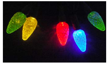
LED holiday lights

Replacing standard holiday lights with LED lights reduces energy consumption by 99 percent and reduces the time spent hassling with burned-out bulb replacement.