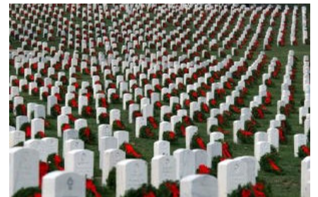
Just a sample of what 10,000 plus wreaths look like when laid on our Veterans graves.

Wreath laying ceremonies were also held at Edmund Muskie's Grave, the Kennedy Family Memorials and at the Mast of the U.S.S. Maine.