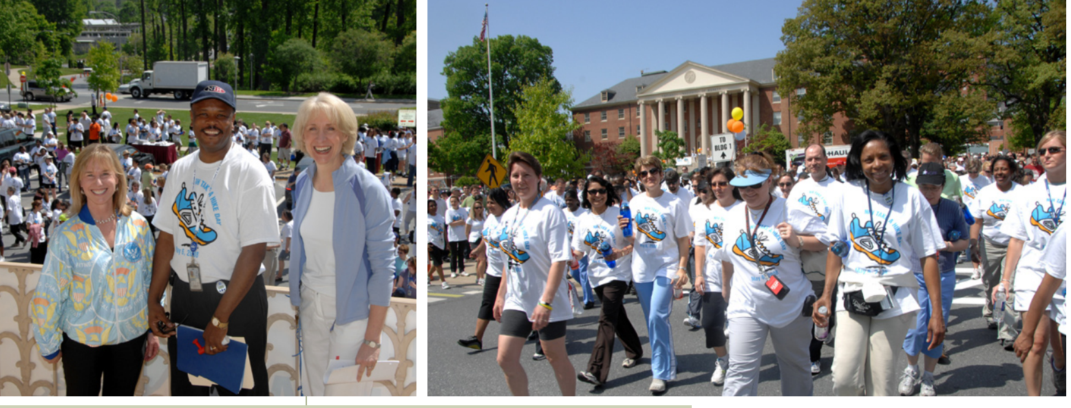
HIKE DAY CONTINUED FROM PAGE 1