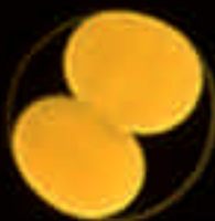
Two-day old embryo

Odontaster meridionalis is a small (about 4 inches from tip to tip) sea star found in McMurdo Sound that feeds primarily on sponges. Reproduction in this species occurs from approximately August to October during which time adults release either eggs or sperm into the ocean. Once fertilized, the resulting embryos drift with the currents and live among the plankton where they develop into feeding larvae. Eventually, these larvae will settle and change into a juvenile sea star.