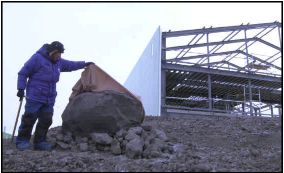
Above photo courtesy of Tina White Right photo by Brien Barnett / The Antarctic Sun