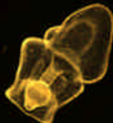
44-day old larvae