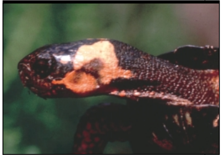
Dennis W. Herman

The upper shell or carapace is usually black to mahogany-brown and may be marked with lighter whitish to yellowish sunburst rays of color in the individual scutes. The lower shell, or plastron, is usually black with varying amounts of white or pale yellow patches. The neck, limbs, and tail are very dark brown or black, with or without streaks of red or orange. The top of the head is usually speckled with black and the lower jaw may be spotted with red or orange. The upper jaw is notched, creating two sharp points on the beak. Along the back is found a mid-dorsal keel or ridge and pronounced sculptured growth rings around the scutes are present on the carapace