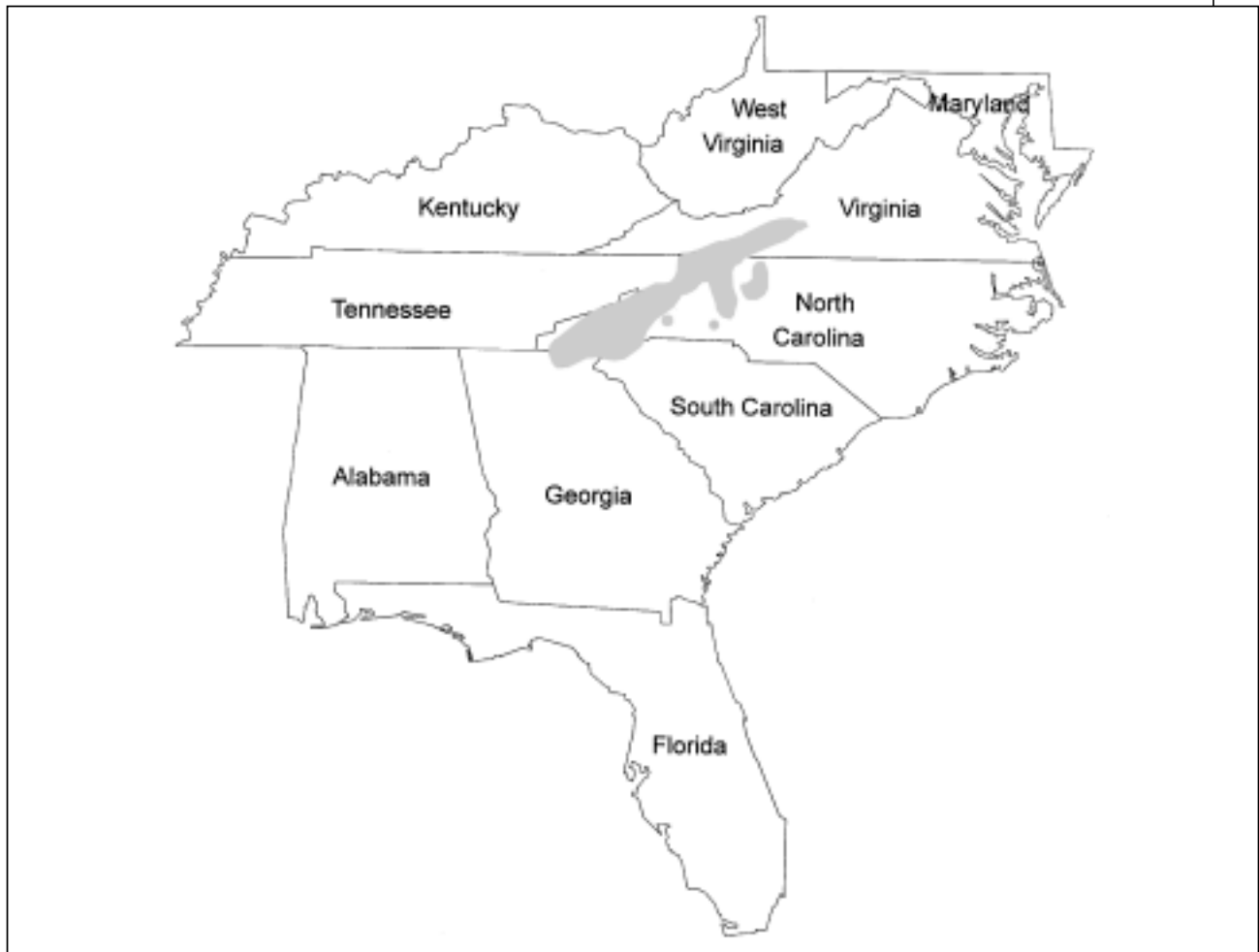
Figure 2.1 Range of bog turtles ( Clemmys muhlenbergii ) in the Southeast.

have been found along ten river basins in the Southeast in both the Mississippi-Ohio and Atlantic drainages.