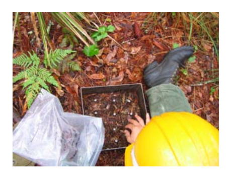
Figure 3. Diagram and photograph of the bulk density sampling square with depth marker locations.