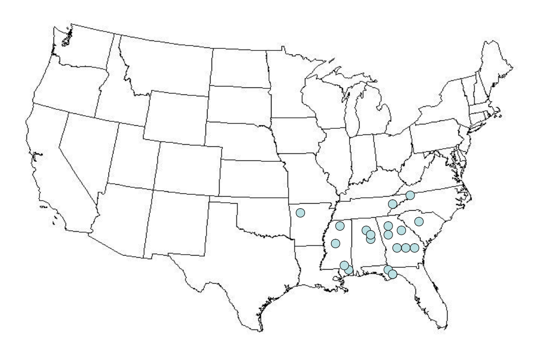
Figure 1. Location of bulk density study units.

After detailed discussions with over 20 land managers, a total of 74 sampling sites on 15 management agency lands in 7 southern states were selected to be included in the study (fig. 1, table 1). Sites were grouped by stand type (loblolly pine, slash pine, shortleaf pine, mixed pine [loblolly or pitch pine] and hardwood, and hardwood). We attempted to select pine sites with pure pine overstories and pure needle litter layers to reduce variability. However, in shortleaf pine sites, all sites contained a significant proportion of hardwoods and a mix of needle and hardwood leaf litter.