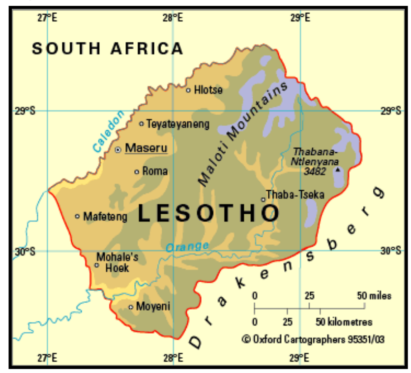
Map A. Lesotho

Although the high HIV/AIDS prevalence prevents the total population from increasing rapidly, high anthropogenic pressure has become a driving force in ongoing land degradation problems, forcing people to settle on and exploit marginal lands.