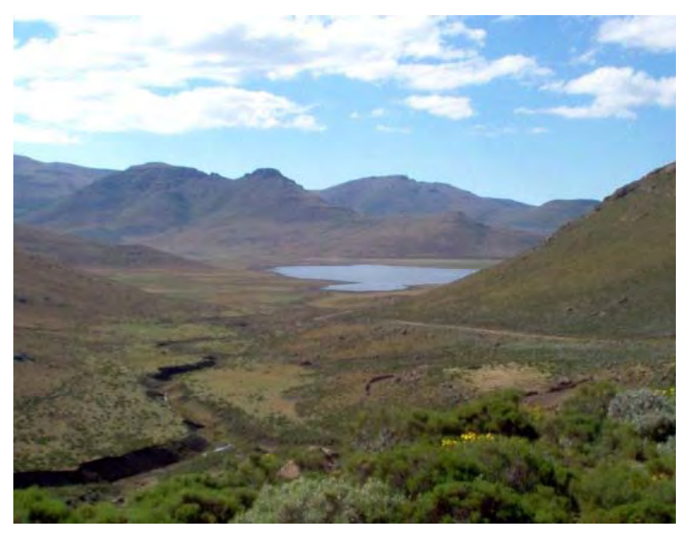
Wetlands like these in Lesotho are high in biodiversity.

This report is designed to fulfill legal requirements under sections 118/119 of the Foreign Assistance Act. The act requires all USAID