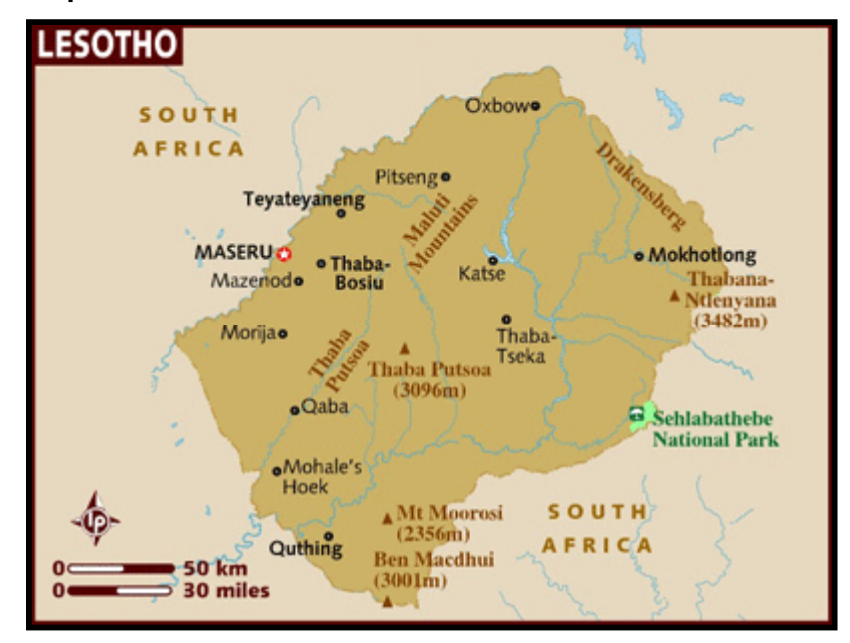
Map B. Sehlabathebe National Park

Lesotho has the smallest amount of protected land within any country on the entire continent of Africa, with less than 0.4 percent of total land under protection. The one national park (a