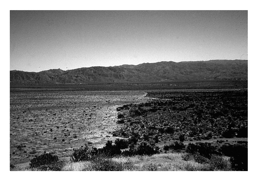
Figure 2. The effects of fire in the desert are obvious in this photo taken near Palm Springs, California, about five years after the blaze. Note the almost complete elimination of perennial shrubs in the burned area to the left. Perennial plant species in the Mojave and Colorado Deserts are long-lived and very sensitive to fire, traits that collectively contribute to the long recovery times typical of many desert plant communities after fire.

sponse to SO<sub>2</sub> and NO<sub>2</sub>. Larrea tridentata is sensitive to fumigation by these pollutants under experimental conditions, displaying extensive leaf injury and reduced growth or dry weight. Encelia farinosa and Ambrosia dumosa show intermediate responses, while Atriplex canescens appears to be resistant (Thompson and others 1980). Sensitivity also varies among native annual plants, with Camisonia claviformis, C. hirtella, and Cryptantha nevadensis exhibiting leaf injury at low concentrations of SO<sub>2</sub> and O<sub>3</sub> (Thompson and others 1984b).