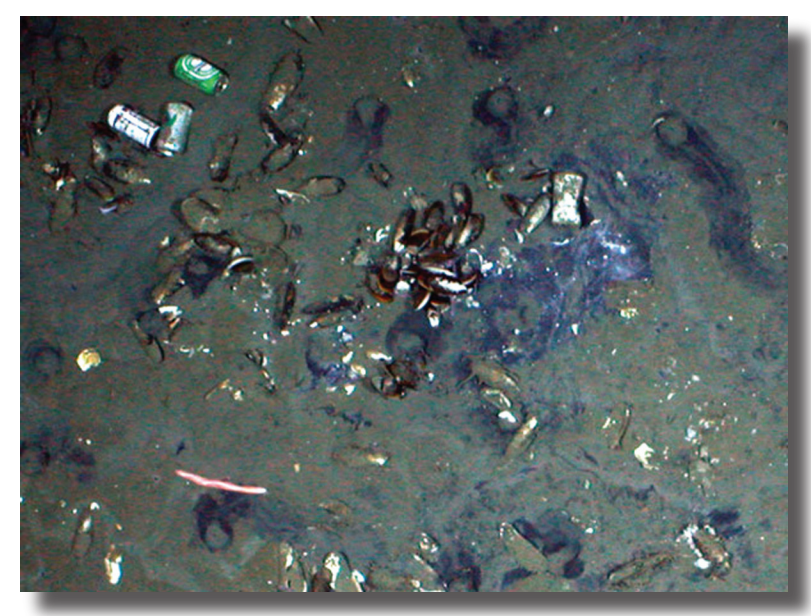
Evidence of human activity extends even hundreds of miles from shore and 7,260 feet below the ocean surface.