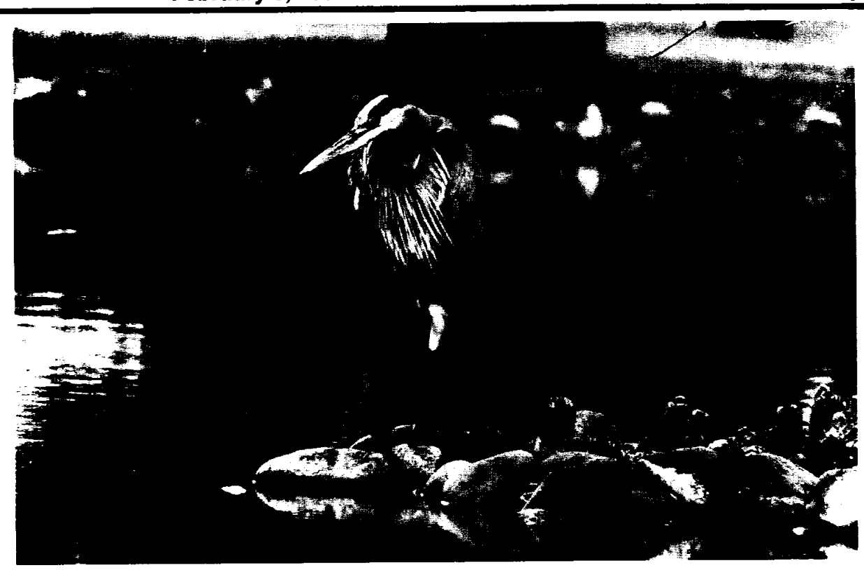
A Great Blue Heron enjoys the spring-like weather of late January from a rocky outcropping along the banks of one of JSC's ponds. JSC employee Jack Jacob captured the bird on film as it balanced in a characteristic one-legged stance.