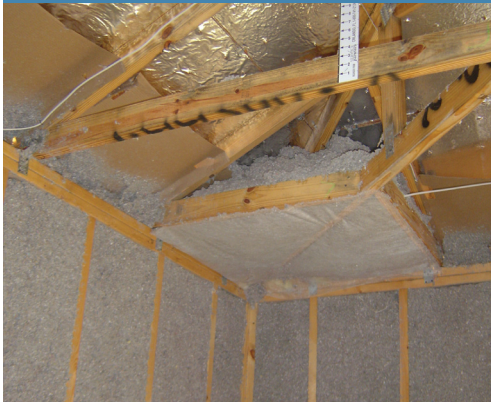
Walls and ceilings are insulated with naturally bug-resistant Green Fiber blown-in cellulose insulation – R-30 in the ceiling and R-13 in the walls.