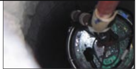
IN the ice