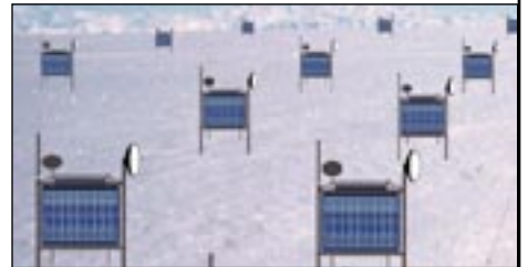
ON the ice