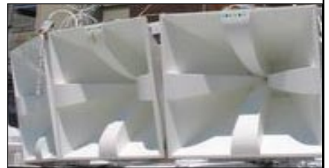
ABOVE the ice