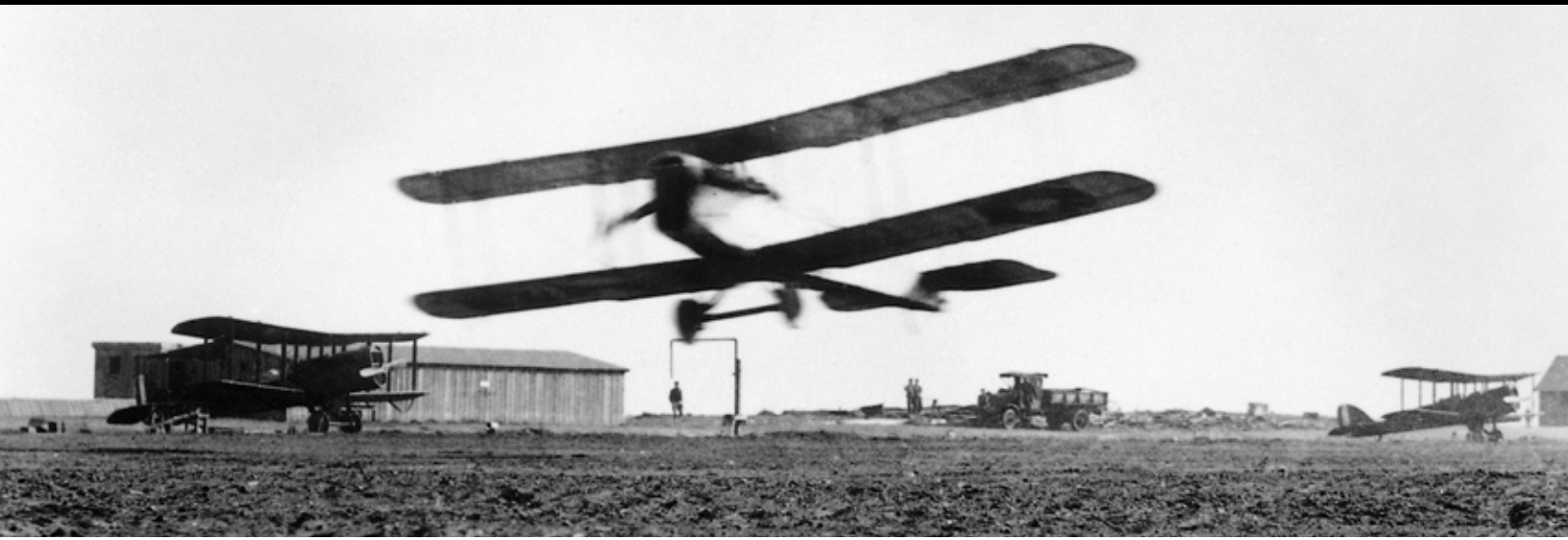
Crissy Airfield in 1919.