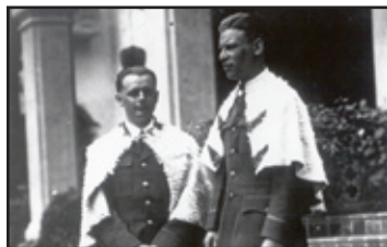
Illustration: Sails were cut from canvas wings. NPS Staff Drawing Above: Islanders honored "Bird of Paradise" pilots with feather capes reserved for Hawaiian royalty.

After the around-the-world flight, which made short hops between the northern continents, the nation engaged the next big challenge— long distance flight crossing entire oceans. In August of 1925, Navy Commander John Rogers led two seaplanes down the ramp into the bay at Crissy Field to meet that challenge. After crossing six miles of the bay at full throttle, the PN-9 planes finally became airborne and sped west towards Hawaii at 115 miles per hour.