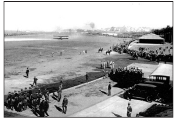
Crowds of thousands greet around-the-world fliers at Crissy Field.

Near the end of their journey, the courageous pilots received a hero's welcome at Crissy Field. When the surviving aircraft finally returned to Clover Field on September 28th, the Chicago and New Orleans had covered 26,345 miles in 172 days.