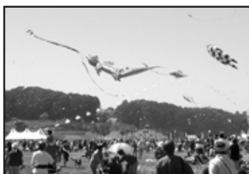
Crowds once again flock to see things fly at opening day of the restored Crissy Field.

Standing tribute, today's Crissy Field is the most intact 1920s Army airfield west of the Mississippi. The restored grass field and surrounding original buildings reflect the area's appearance when the pioneers of flight made history here. As you look across the field, you can almost hear the roar of aircraft as young aviators took off, risking their lives to make air travel the safe and reliable form of transportation that it is today.