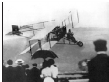
Lincoln Beachey flies his "Little Looper" in 1913.

Even in the early years of aviation, Lincoln Beachey, the father of aerobatics, knew that airplanes would one day be reliable and commonplace transportation. To promote this belief, he flew anytime he could find an audience. And it wasn't hard. Crowds flocked to see his stunts and if he would survive them. Beachey was the first person to fly upside down, and to perform a tail slide and a spin recovery. So when the Panama-Pacific International Exposition opened in San Francisco, he became a main attraction flying over what would become Crissy Field.