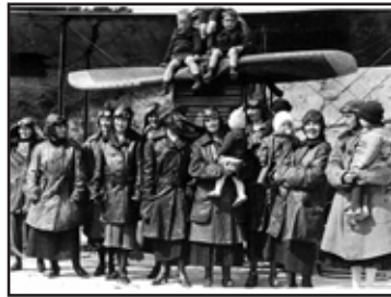
Pilots took their families up to prove that aircraft were safe.

Have you ever been scared during an airplane flight? Most of us have at one time or another, even in today's very safe aircraft. However, during the pioneering days of flight, every trip was death-defying and possibly one's last.