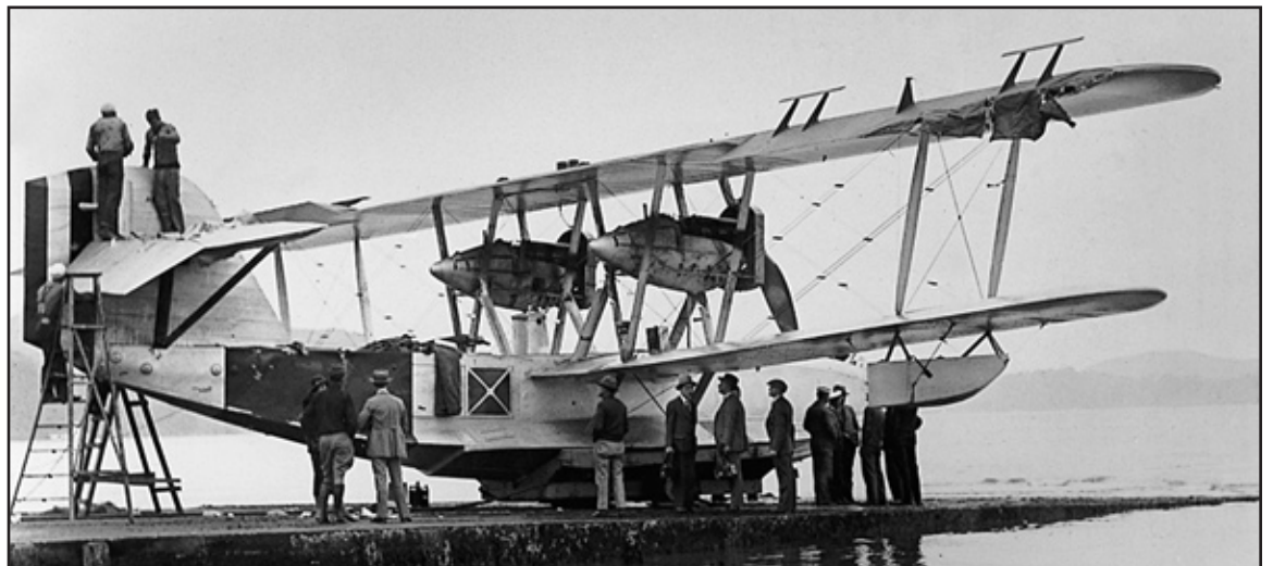
Right: Inspecting the PN-9 at Crissy Field, after being forced down. Note the damaged right wing tip.