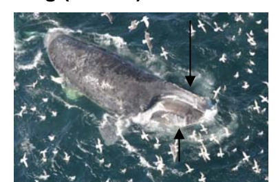
Dead right whale (floating on side; head to the right), note arched mouth and baleen (arrows). DFO

(space below provided for sighting notes)