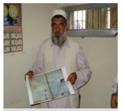
A customer with a copy of his digitized title deed.

Postal Services Expand: The Afghan Postal Commission issued its seventh license to a private company for the provision of ground parcel post and high-speed international courier services. AES Cargo (a subsidiary of the United Parcel Service/UPS) and Dubai-based Transit Co., Ltd. will initially provide deliveries to the top six urban areas of Afghanistan as part of a USAID-sponsored project to accelerate the development and creation of a competitive playing field for postal services in Afghanistan.