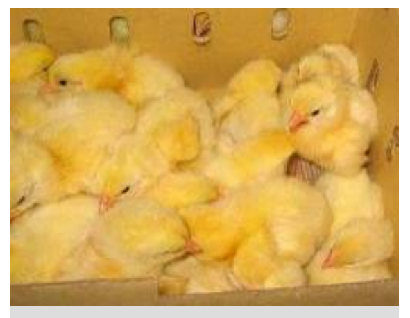
23,000 chicks hatched in December, laying the foundation for a poultry industry revival in eastern Afghanistan.

eastern region sold over $8,200 of cauliflower, cabbage, carrots, and eggplants as well as over $13,500 in fruit in December. Over 1,000 farmers participated in training on topics such as garden layout, seedling production, harvesting, marketing, and consecutive planting as a means to reduce market risks. One training session hosted by the fruit marketing program in Kunar was covered by local media in order to raise awareness about the impact of the program on farmers' livelihoods.