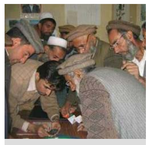
Training at the Kunar Directorate of Agriculture for new text messaging system distributing market price information.

eastern region sold over $8,200 of cauliflower, cabbage, carrots, and eggplants as well as over $13,500 in fruit in December. Over 1,000 farmers participated in training on topics such as garden layout, seedling production, harvesting, marketing, and consecutive planting as a means to reduce market risks. One training session hosted by the fruit marketing program in Kunar was covered by local media in order to raise awareness about the impact of the program on farmers' livelihoods.