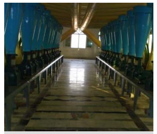
The Surat Zadah Flour Mill in Balkh province will generate 160 employment opportunities due to a $500,000 loan from the USAID-assisted Afghanistan Rural Finance Center.

Loan Creates Jobs: On January 18, the Board of Directors of the Afghanistan Rural Finance Center approved a $500,000 loan to Surat Zadah Flour Mill in Balkh province. This loan will create more than 160 employment opportunities in the northern region, contribute to regional economic development, and encourage farmers to grow licit crops. Contract farmers in Baghlan, Kunduz, Faryab, Samangan, Balkh, and Jawzjan provinces will use the advance payments to grow wheat to sell to the mill. As of September 2007, USAID's economic growth program has created more than 25,000 jobs through various lending vehicles in the northern region of Afghanistan.