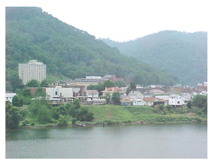
Pictured Above: City of Montgomery shown above the Kanawha River banks.

The purpose of the Water & Waste Disposal Programs is to build, repair and improve public water systems, and waste collection & treatment systems.