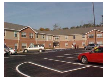
Pictured Above: Knollview Village Apartments, a 48-unit apartment complex for low-income people 55 and older, located on a five-acre knoll just west of St. Albans, at 571 MacCorkle Ave., W, in Charleston, WV. This project was funded through Rural Development's Rural Renting Housing Program.