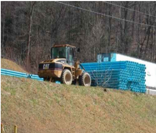
Pictured Above: Heavy equipment moves 6-inch pipe in preparation for installation in the Lizemores area.

The existing water supply in the Tuckers Bottom, Indore, Lizemores, Fola and Independence areas mainly consists of wells. Many residents in these areas have complained about the odor and taste associated with the water as well as problems with stained clothing after washing laundry.