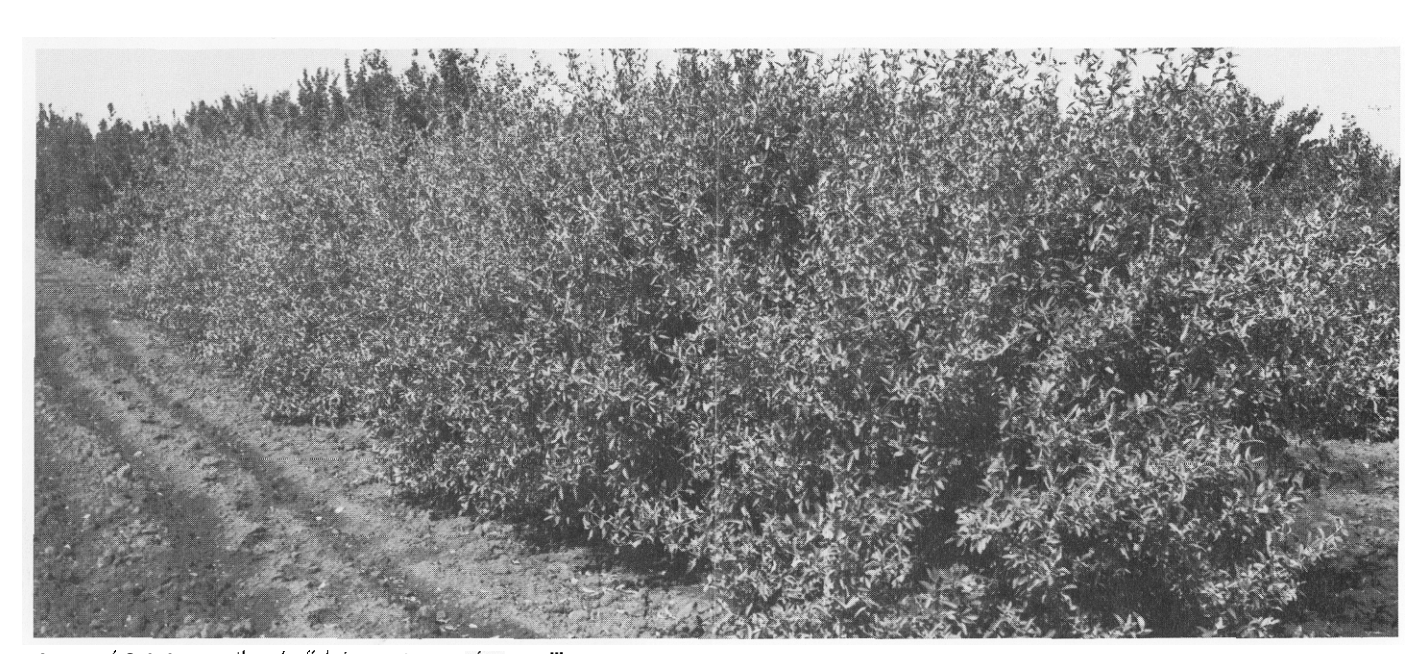
A row of Sakakawea silver buffaloberry 4 years after seedlings were planted. The shrubs are about 7 feet tall and 6 feet wide.

Use 2-year-old seedlings that are 12 to 24 inches tall and