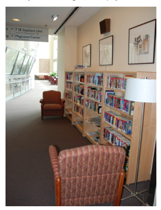
6 NIH RECORD AUGUST 22, 2008