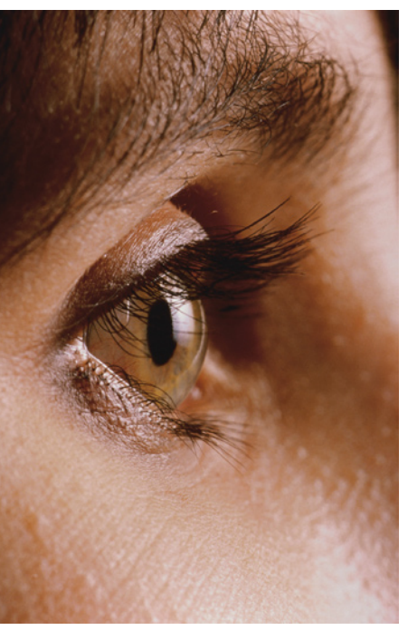
A new drug therapy used to treat abnormal swelling in the eye—diabetic macular edema—has proven less effective than traditional laser treatments

Two chemicals associated with neurodegeneration and inflammation play important and distinct roles in development of neuropathic pain, according to a study funded in part by NINDS. The findings, reported in Nature Medicine, may lead to new treatments that can stop neuropathic pain from developing and alleviate it after it begins. Scientists studied how enzymes called matrix metalloproteinases (MMPs) affect the development of neuropathic pain. Previous research has shown that MMPs play important roles in the inflammation and tissue remodeling associated with some neurodegenerative diseases. Researchers studied MMP-2 and MMP-9 in rodents with a spinal nerve injury. By selectively blocking MMP-9 and MMP-2, the investigators showed that neuropathic pain responses depended on MMP-9 for the first several days after injury. MMP-2 then prompted changes that helped to maintain the pain. The study is the first to show that neuropathic pain has different phases and that the phases are controlled by different MMPs.