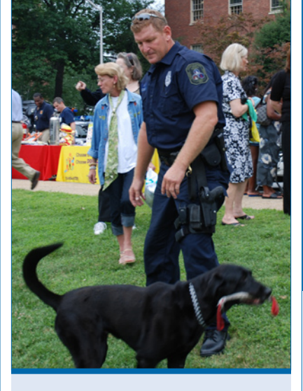
ABOVE • Dog days of summer? NIH observes National Night Out with daytime safety event. See more photos, p. 12.