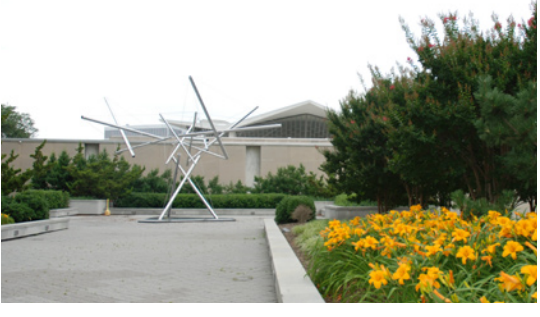
Above : The terrace between NLM (Bldg. 38) and Lister Hill (Bldg. 38A)

Below : On the east side of Bldg. 33 is a wooded area bordering the creek where you can "watch the river flow."