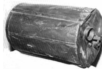
Friction torpedo activated by an operator ashore who pulled a lanyard.