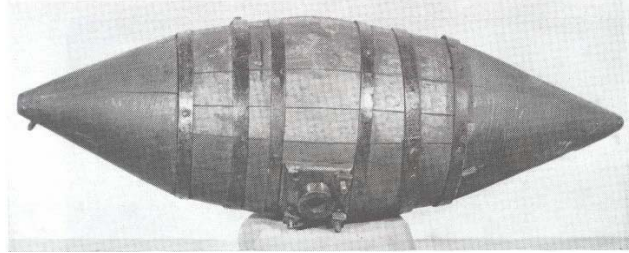
Rains keg torpedo. This example of the most widely used mine, on land or sea, was found in August, 1863, near Charleston.

Admiral David G. Farragut Mobile Bay, Alabama August 5, 1864