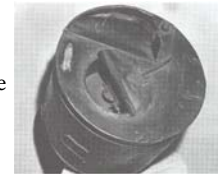
Horological torpedo captured in the St. John's River, February, 1864.

Faced with a small navy and a scarcity of warships, the Confederacy was forced to rely on a few heavily-armored rams and ingenious "infernal machines" for inland water and coastal defense.