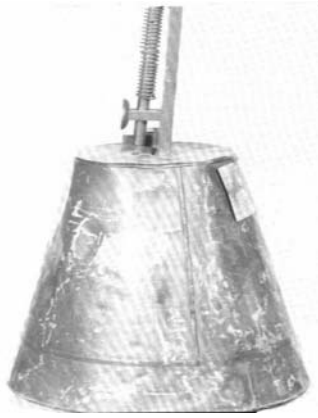
Fretwell-Singer torpedo. The plunger was activated when an iron weight was knocked from the top of the air chamber.