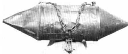
Floating tin torpedo.