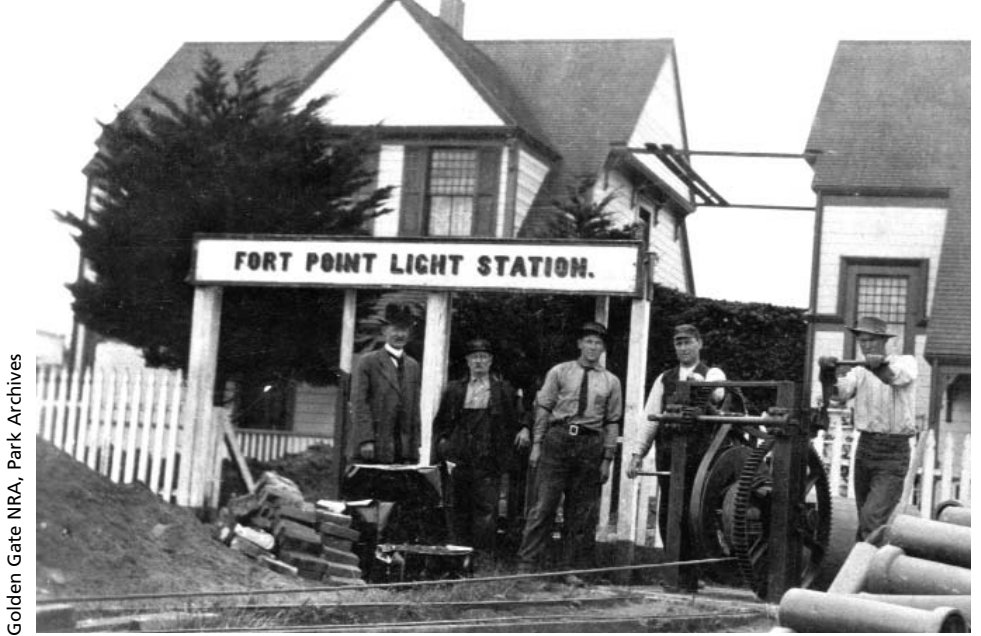
A hand-cranked tram lifted supplies to the keepers' houses.

operate the fort's lighthouse. Keepers scrubbed, dusted, and painted when not performing their main duty of tending the light's oil lamps. The lamps burned lard oil or kerosene, which keepers hauled up narrow stairs until 1910, when incandescent lamps were installed. They also constantly trimmed the lamp's wicks to keep the light bright and the lens clear of smoke. In addition, they wound and maintained the clockwork mechanisms that ran the light and fog bells. The light had to burn at all times, regardless of the weather. The keeper's job was not easy, and the loneliness and hard work were too much for many. The Fort Point lighthouse had seven keepers and 14 assistant keepers in its first ten years, eleven of whom resigned within a year.