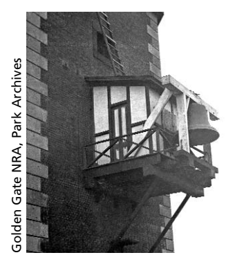
Fog bell on the side of the fort.

Lonely yet comforting, the sounds of fog horns bring a feeling of nostalgia to many San Franciscans. For those on ships negotiating the fog-shrouded Golden Gate, the fog signals meant security and safety. From the 1850s through 1904, a bell chimed from Fort Point when the fog was in. A clockwork mechanism rang the bell, and if the mechanism failed, the keepers or their spouses rang the bell manually, a task requiring them to risk their lives by climbing down a windswept ladder on the side of the fort only to stand below the fort's