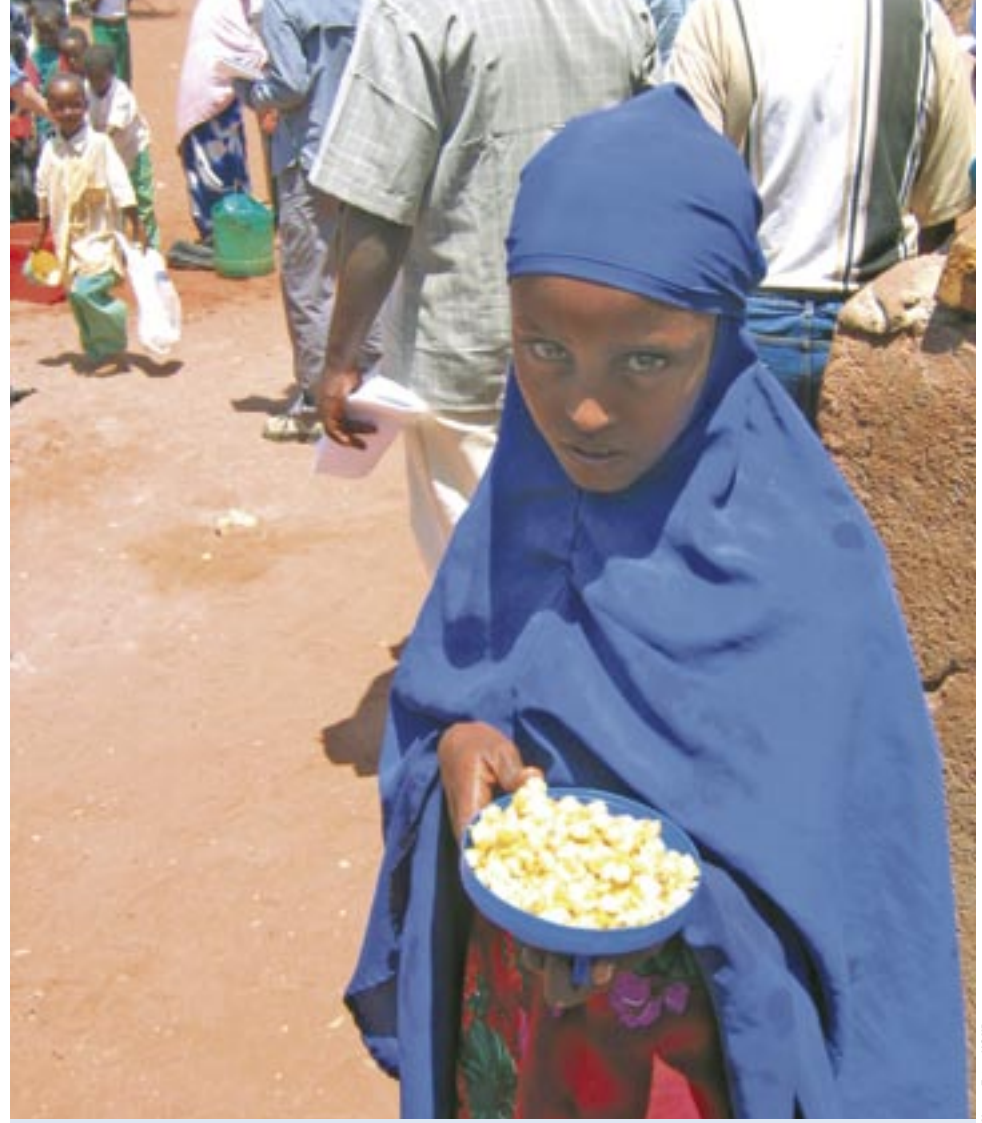
A student in Wajir, northeastern Kenya, receives a school lunch from the World Food Program.

"The combination of desperate poverty and lack of governance is dangerous to the entire region—and maybe beyond the region. Somehow we've got to find the right resources, and enough of them, to deal with the long-term issues. Otherwise, we'll be struggling to deal with this kind of humanitarian crisis, and worse, at shorter and shorter intervals." \star