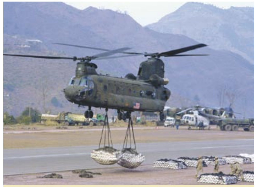
SLING LOAD-A U.S. Army Chinook helicopter lifts 4.5 tons of wheat flour from the Muzaffarabad airfield in Azad Jammu and Kashmir. U.S. Marines stand by after clipping the loads to the hovering helicopter. After a 20-minute flight to deliver the food to remote villages damaged by the earthquake, the chopper will return for fresh sling loads. In the background, a UN white Mi-8 Russian-built helicopter is slowly loaded by hand with two tons of food for the airlift.

The narrow corridors between the peaks of the region mean that it is only possible to safely operate around 45 helicopters at