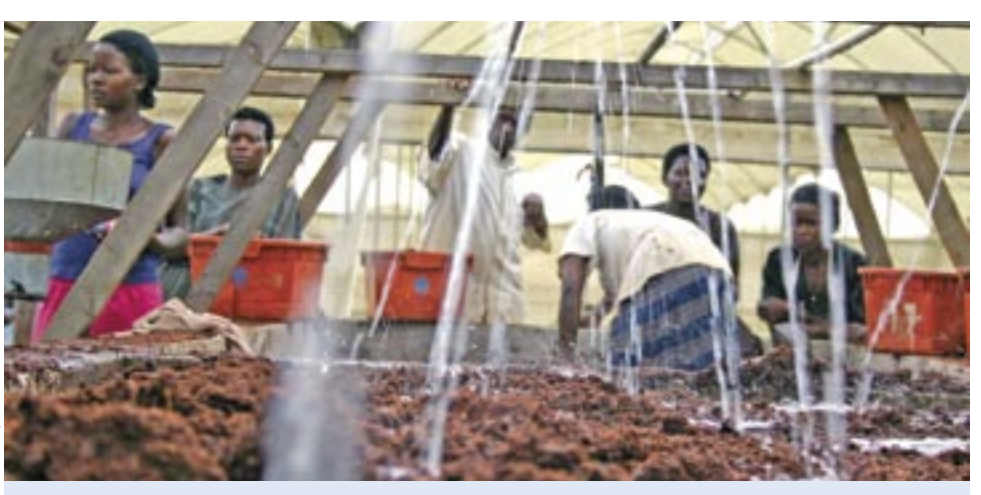
A soil and peat cleansing bed in Uganda's flower industry, which has received support from the Strengthening the Competitiveness of Private Enterprise project.