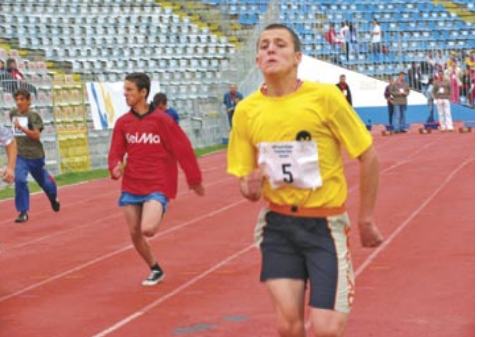
Athletes compete at the Special Olympics Friendship Games in Constanta—the first international event of its kind held in Romania. The competition, held in 2005, drew more than 500 athletes from nine countries.

and as a child became involved with a foundation providing educational, vocational, and social programs for the disabled. This helped her to complete her education and begin work as a cook, earning enough to help pay the bills in the apartment she shares with her mother. She later became involved with the Special Olympics. \bigstar