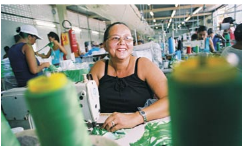
A seamstress of a small swimwear firm based in Bahia, Brazil, is working to help the business grow through exports. This is one of several micro and small enterprises in north and northeast Brazil receiving trade technical assistance from USAID.