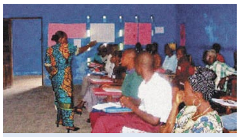
USAID helped train teachers who are taking part in Liberia's Accelerated Learning Program.

USAID's Office of Transition Initiatives (OTI), whose mandate is to quickly deploy high-impact programs, began the Liberia Transition Initiative in 2004. Now, with