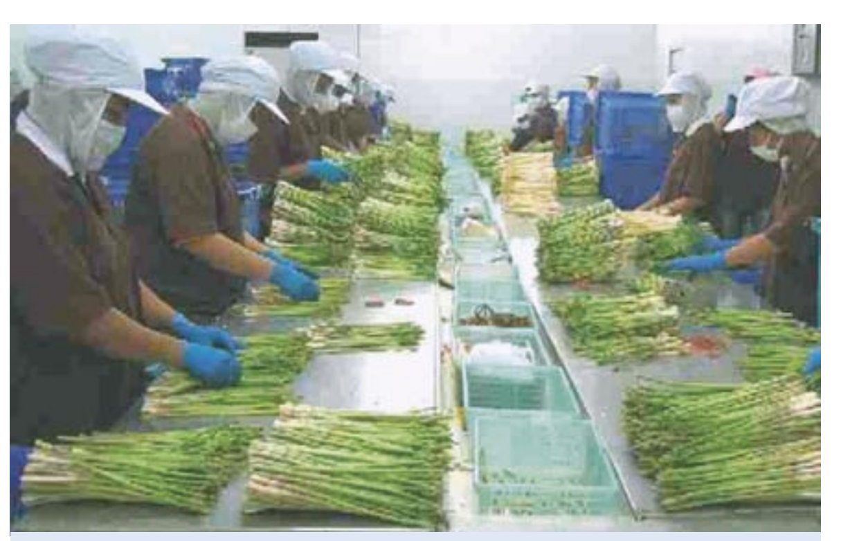
Maintaining production standards is critical for successful vegetable export programs. A distance learning program sponsored by USAID and the World Bank is tackling this issue in developing countries.

The virtual course, named "Standards and Trade: Challenges and Opportunities for Developing Country Exports," invited facilitators from international organizations, governments, the private sector, NGOs, and universities to lead the virtual classrooms