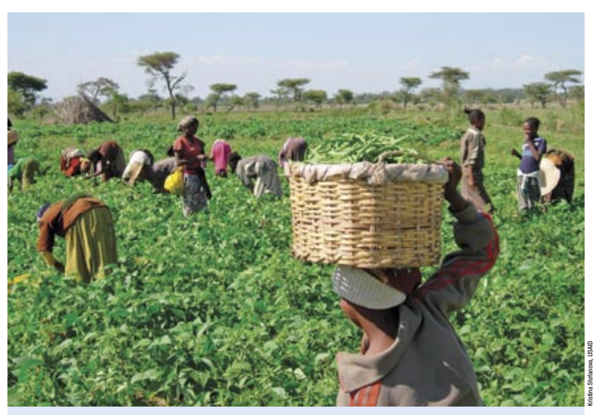
Women pick green beans in a field in Ethiopia. The beans are about to be graded, packed, and shipped to Europe where they will be sold at supermarkets. This is just one example of a project USAID runs helping farmers improve and export their produce.

The U.S. Trade and Development Agency advances economic development and U.S. commercial interests in developing and middle-income countries. The agency funds various forms of technical assistance, feasibility studies, training, orientation visits, and business workshops that support the