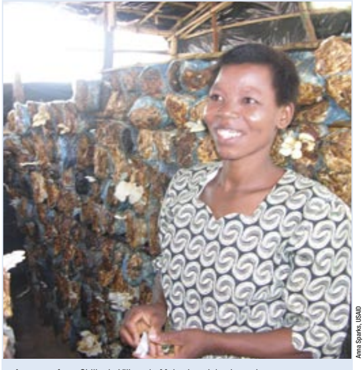
A woman from Chilipula Village in Malawi explains how she grows mushrooms. She and other farmers in the region are getting help with their crops through the Chia Lagoon Watershed Management Project, a $4.8 million collaboration between public and private institutions.

has created a better understanding of the interlinkages of economic and environmental problems among the stakeholders, and how to move forward to solve these problems in a way that brings lasting results and benefits to all the stakeholders," he said. \star