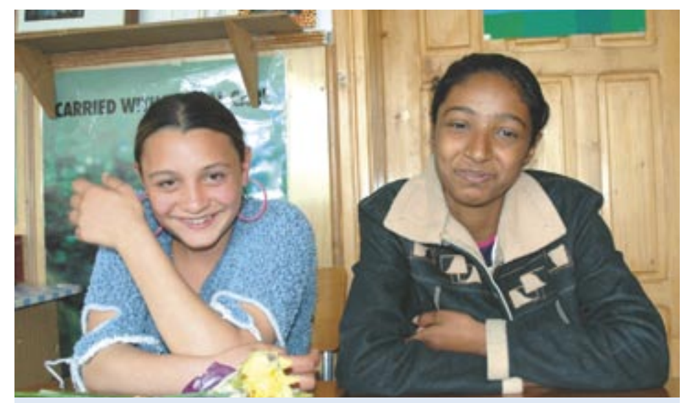
Romanian students in a Gata, Dispus si Capabil (Ready, Willing, and Able) training class. The GDC project, supported over the years by three USAID grants, is designed to improve living conditions and educational opportunities for severely impoverished families and offers children educational and social support and their parents the tools to provide for their families.