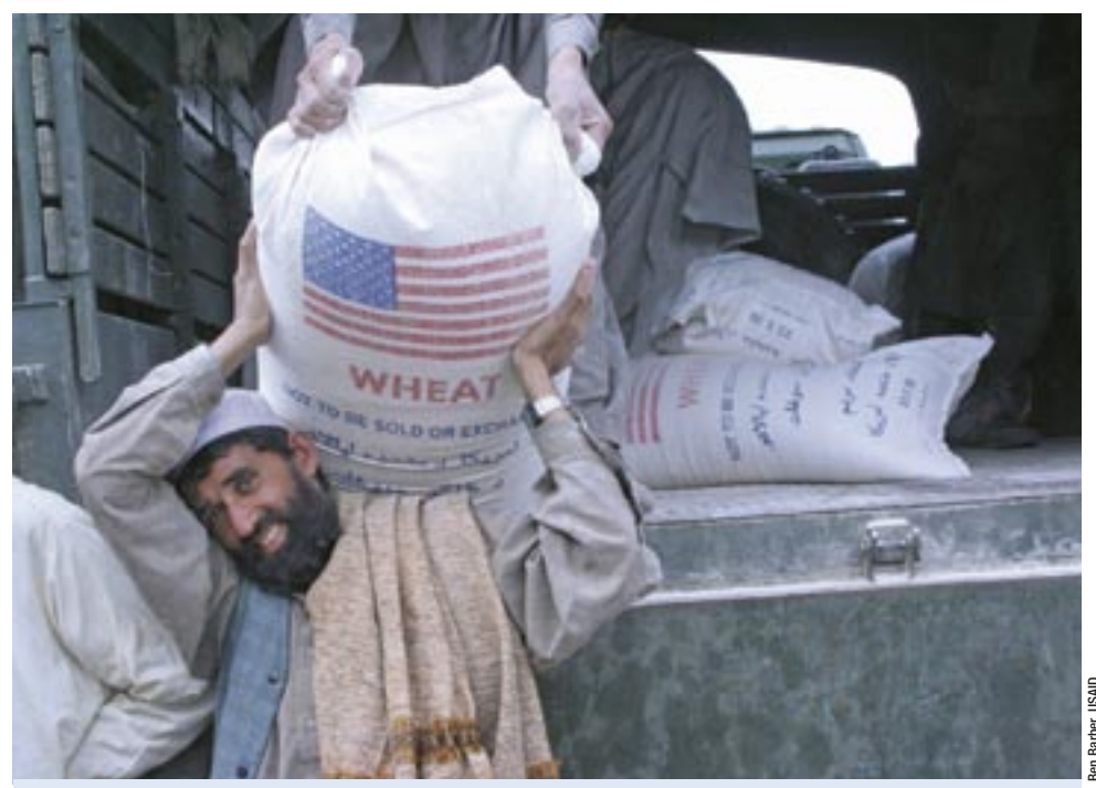
HAULING FLOUR —A Pakistani worker unloads U.S.-donated wheat flour at the Mehra Camp for displaced earthquake survivors. Families use the flour to make flat bread.

In early February, USAID provided tens of thousands of families with vouchers to