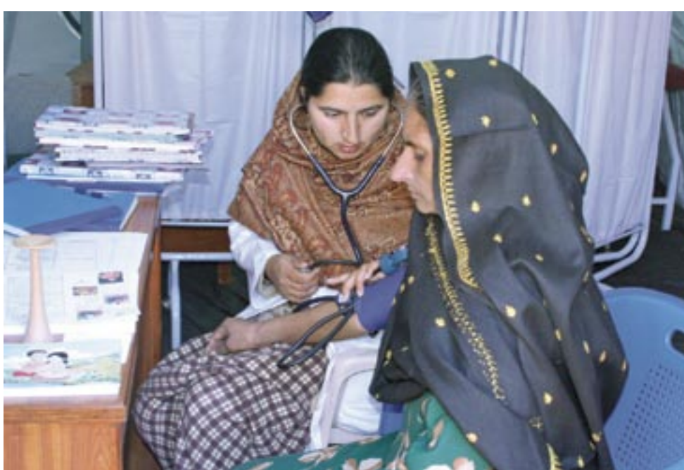
TRAUMATIC SHOCK—A doctor with the American Refugee Committee examines an earthquake survivor in a tent clinic above the city of Bagh. The USAID-supported medical team said many people have problems such as pain, insomnia, and indigestion due to depression and post-traumatic shock. However, through quick treatment of contagious diseases and vaccination campaigns, the death rate this winter has been lower than in most previous years, the World Health Organization said.