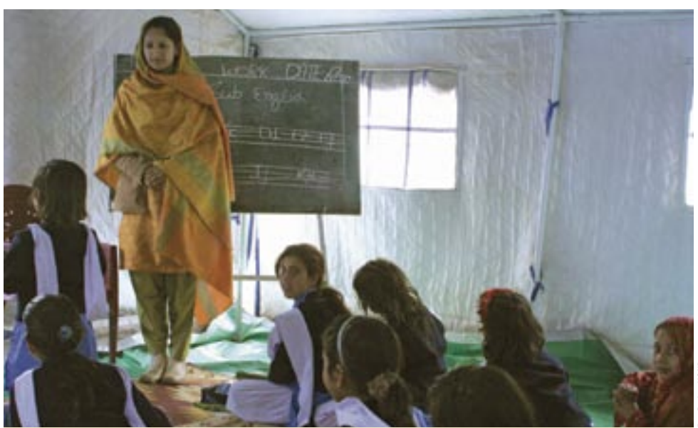
FIRST LESSONS—One of seven young women teachers brought to Mehra Camp from a nearby city teaches girls in a tent school set up with U.S. assistance. Most of the girls said they had never been to school before, but after four months of education, they already were reading English and Urdu and filling their notebooks with vocabulary, math, and drawings.

Most families expect to upgrade to the new houses this spring. Then many hope to expand and build on as resources permit. \star