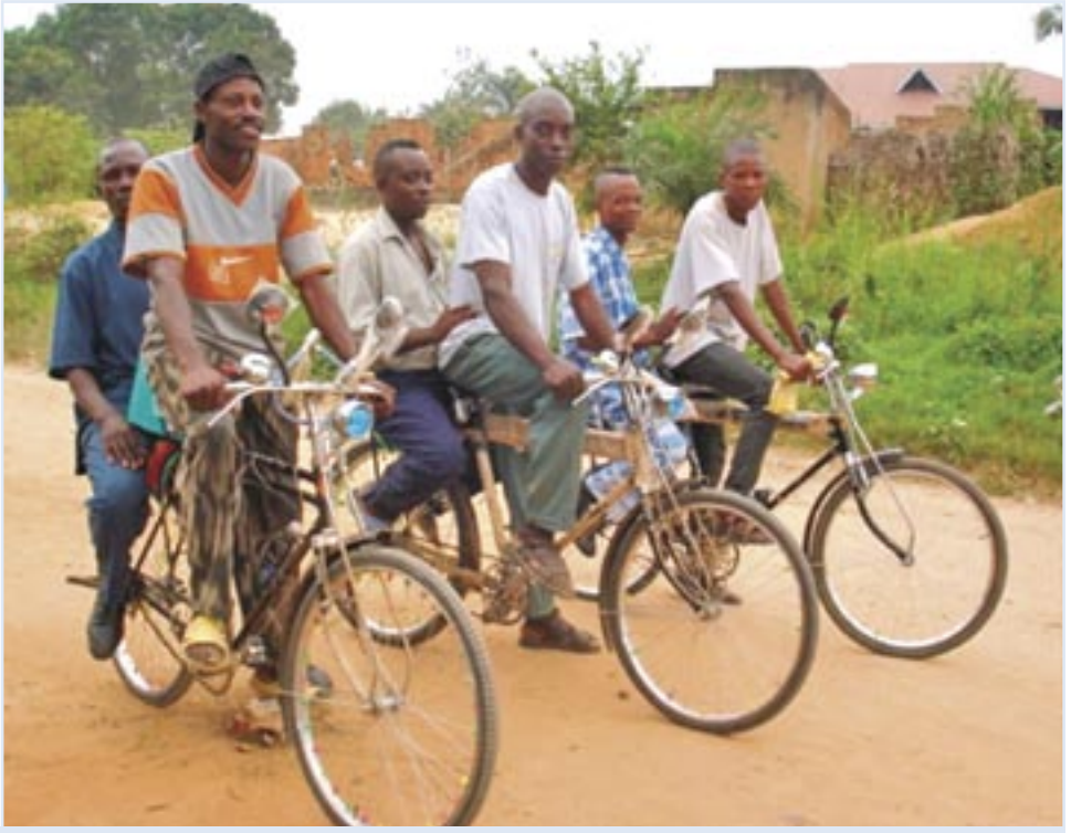
Ex-combatants in the Congo's east-central Maniema province participated in a USAID-funded project that provided bicycles so the community could start a bicycle taxi business. About 200 ex-combatants participated and are earning as much as $25 per day, a large salary for that region.