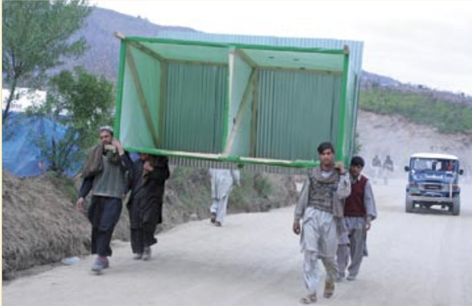
NEW LATRINE —Workers deliver a new latrine to its site in the Mehra Camp for 20,000 Pakistanis displaced following the October 2005 earthquake. The latrines provide privacy, especially important for women in the Muslim society, as well as sanitation, which has prevented outbreaks of cholera and other diseases. USAID provides materials and funds NGOs that build latrines.