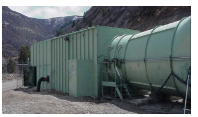
Typical mine fan installation

On October 11, 1992, a fire was discovered in a conveyor entry near a portal. High air velocities through the conveyor enclosure and airlock area caused the fire to spread rapidly. The mine fans were shut down after the mine was evacuated.