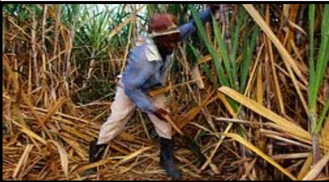
ECONOMIC HARVEST — The new sugar plantation near Segou is expected create as many as 5,000 new jobs.

The $216 million sugar production and processing enterprise, being developed in partnership among USAID, the government of Mali and the Louisiana-based firm Schaffer & Associates is also expected to attract more foreign investment here.