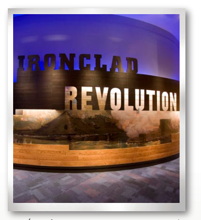
The Monitor Center opened March 9, 2007 in Newport News, Va, Photo: The Mariners' Museum