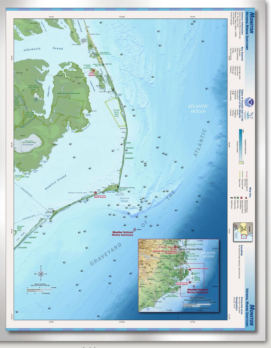
Sanctuary maps available at sanctuaries.noaa.gov

Divers also verified that lionfish have arrived at the Monitor . Lionfish were first reported in coastal North Carolina in 2000 by recreational scuba divers exploring wrecks off Morehead City, located approximately 50 miles to the south of Monitor National Marine Sanctuary. Lionfish are considered an invasive species and their spread up the Atlantic Coast is being watched carefully by sanctuary staff and NOAA's National Centers for Coastal Ocean Science.