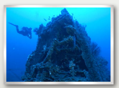
A diver surveys the Monitor.