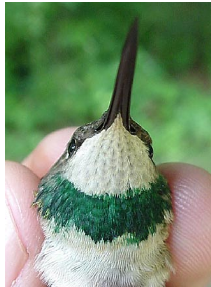
Figure EA-RT-8b: Front view of color marked female Ruby-throated Hummingbird. Note very faint gray streaking that is sometimes visible on the female's throat.