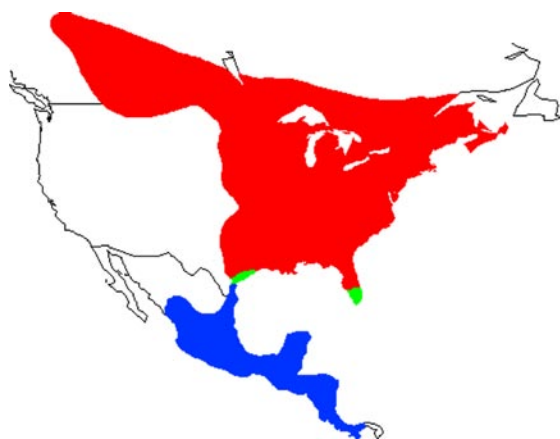
Figure EA-RT-1: Distribution of the Ruby-throated Hummingbird ( Archilochus colubris ). RED—Breeding Range; BLUE—Winter Range; GREEN—Year-round Range

It is not clear what triggers the onset of RTHU migration toward the north in Spring and back south in Autumn; photoperiod (length of day) appears to be a major factor. We do not understand the effects of local or regional weather and there