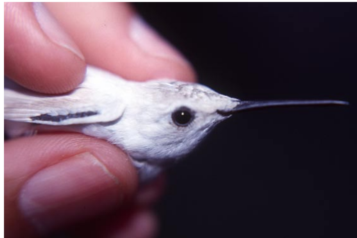
Figure EA-RT-6: Heavily leucistic Ruby-throated Hummingbird, with white feathers, black bill, and black eyes. True albinos have white plumage with pink bill, eyes, and feet.