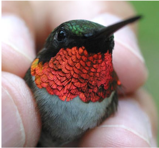
Figure EA-RT-2a: Adult male Ruby-throated Hummingbird, with full red gorget