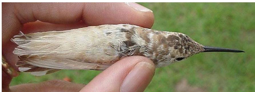
Figure EA-RT-7: Partially leucistic Ruby-throated Hummingbird, with buff and brown feathers.