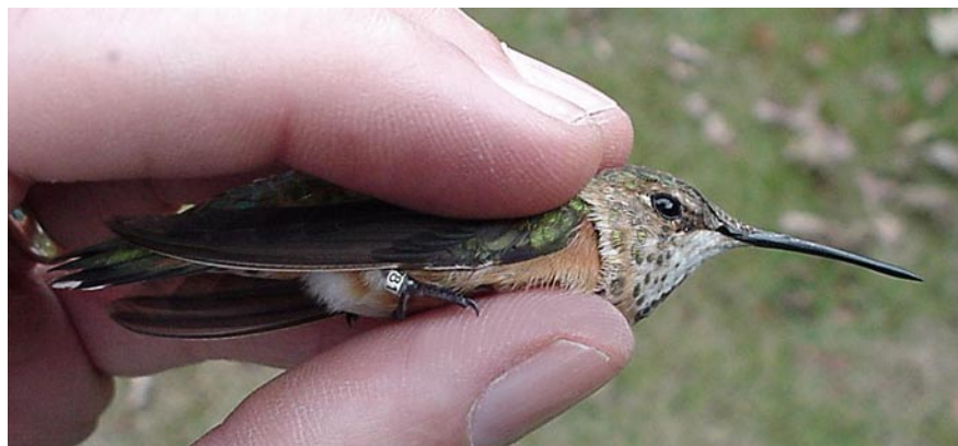
Figure EA-RT-10: Female Rufous Hummingbird. Note rusty sides, rust at base of tail (sometimes hidden), and scattered greenish or metallic-greenish feathers on gorget (Notice band on the bird's right leg.)