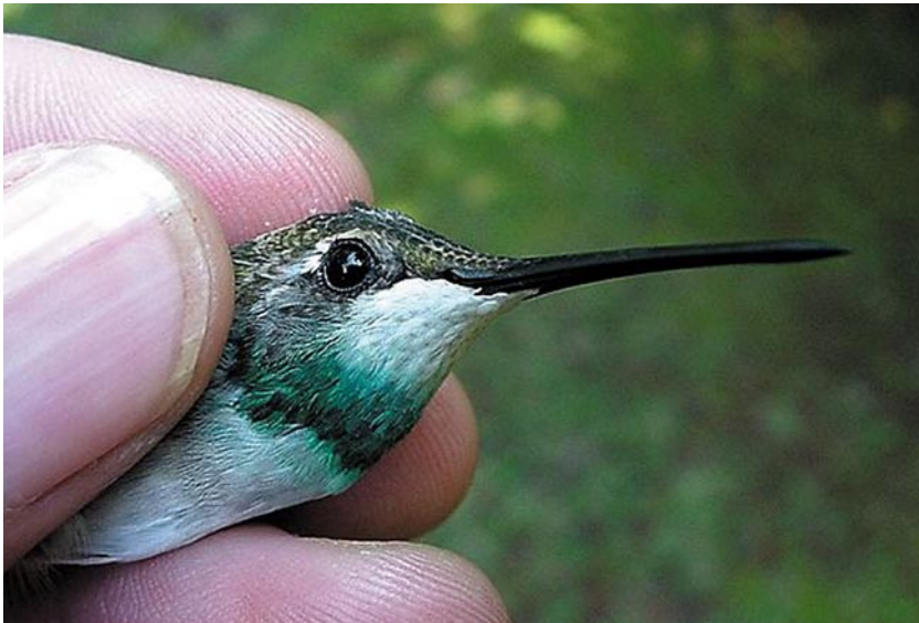
Figure EA-RT-8a: Female Ruby-throated Hummingbird with green color marking on throat and upper breast.