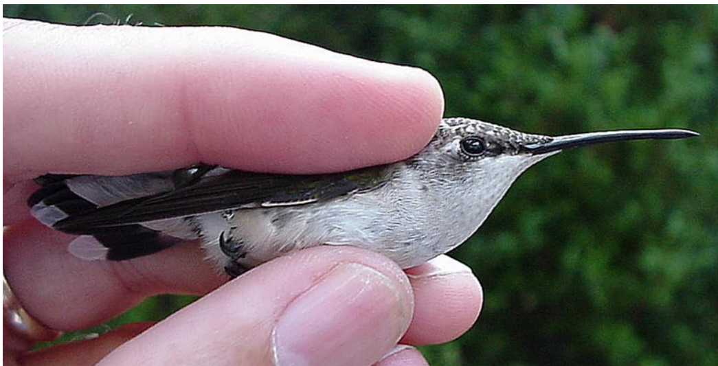
Figure EA-RT-3: Adult female Ruby-throated Hummingbird, with unmarked white gorget (Young female RTHUs and most young males also have unstreaked white throats.)