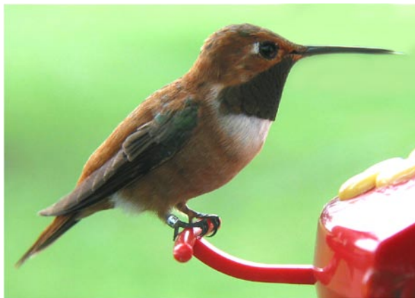
Figure EA-RT-9: Adult male Rufous Hummingbird ( Selasphorus rufus ), with band on right leg. Note overall rusty coloring on back and belly. Viewed from front, gorget is iridescent orange (rather than red of Ruby-throated Hummingbird). This species breeds in western Canada and northwestern U.S. and normally winters in Central Mexico. Female and young male Rufous (Figures 10, 11a, 11b) are far more likely to be seen than adult males in Autumn and Winter in the eastern U.S.