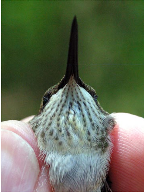
Figure EA-RT-4: Young male Ruby-throated Hummingbird, with throat streaking.