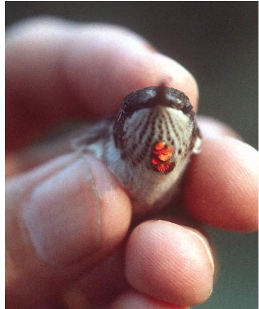
Figure EA-RT-5: Young male Ruby-throated Hummingbird, with few red gorget feathers and throat streaking.