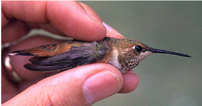
Figures EA-RT-11a : First-year male Rufous Hummingbird.

Note streaking on throat, hints of rust especially at base of tail, streaking on throat, and sometimes one or more iridescent orange gorget feathers —not red as in the Ruby-throated Hummingbird. Among Rufous Hummingbirds, females and young males vary considerably in the amount of rust color in their plumage. Many individuals may not look like the ones in the photos above.