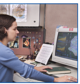
DEA-09003 (as of 1/23/09)