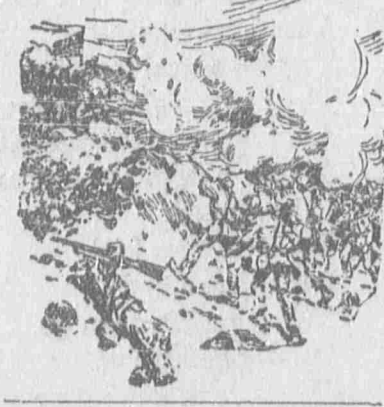
Gettysburg field, on the second day of June, 1863, and began its northward march through the valleys of the Shenandoah and the Cumberland, bent upon an invasion of the loyal